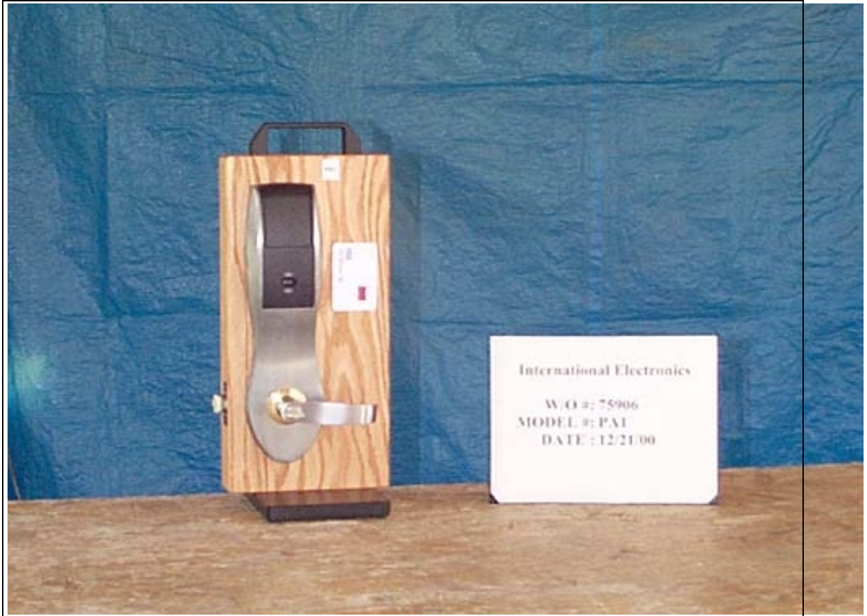
Front View (PA1)