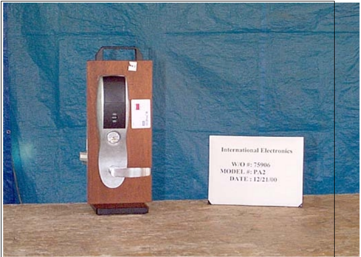
Front View (PA2)