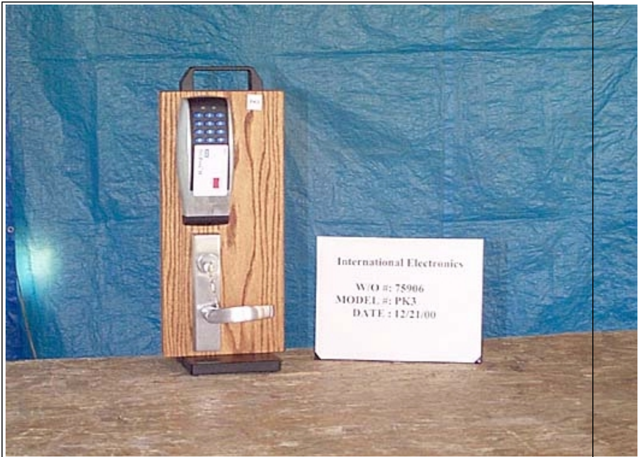
Front View (PK3)