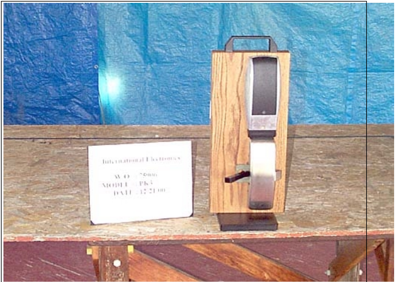
Back View (PK3)