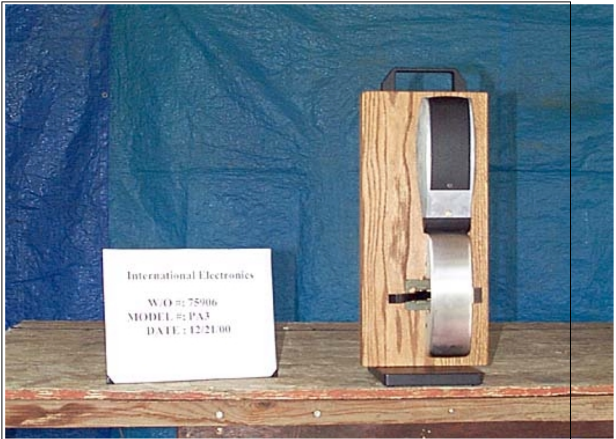
Back View (PA3)