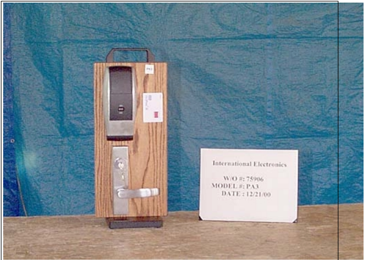
Front View (PA3)