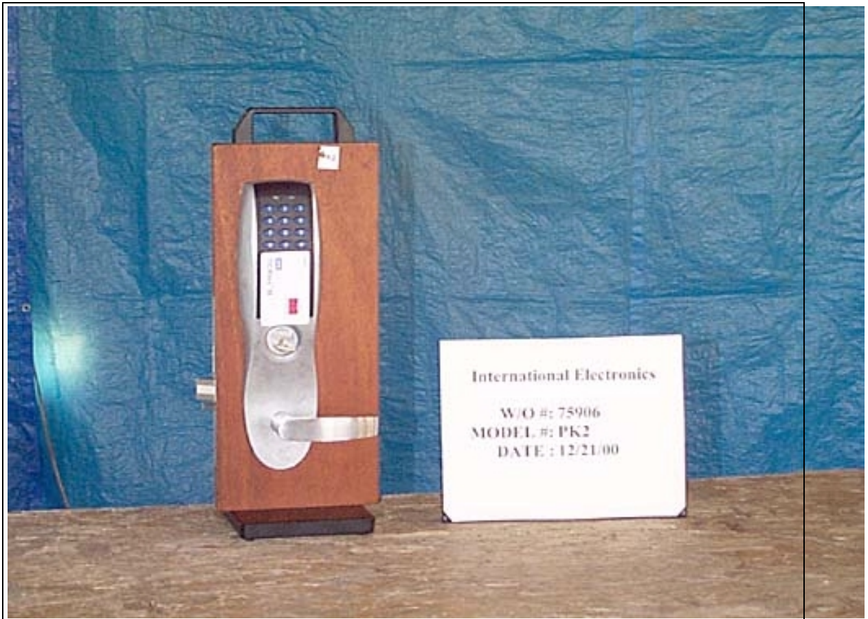
Front View (PK2)