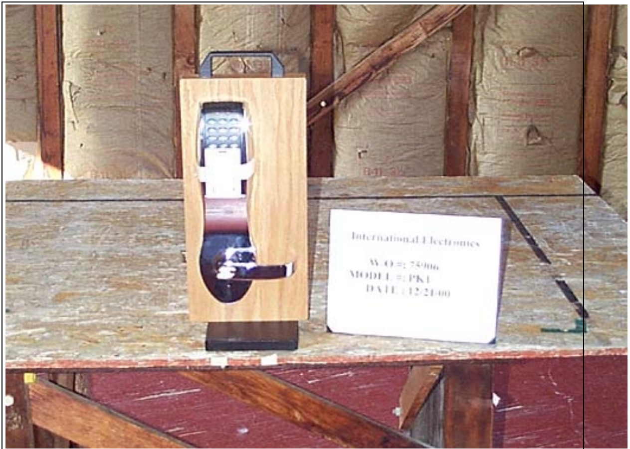
Front View (PK1)