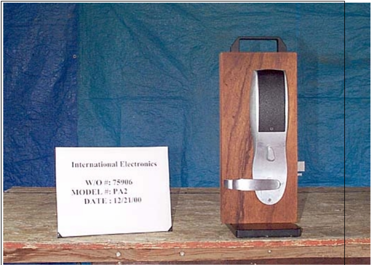
Back View (PA2)