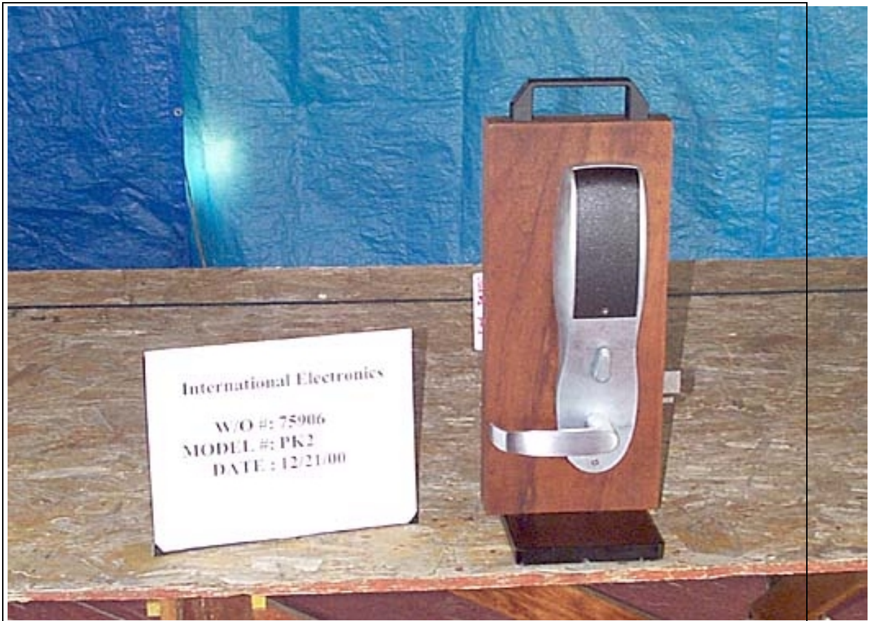
Back View (PK2)