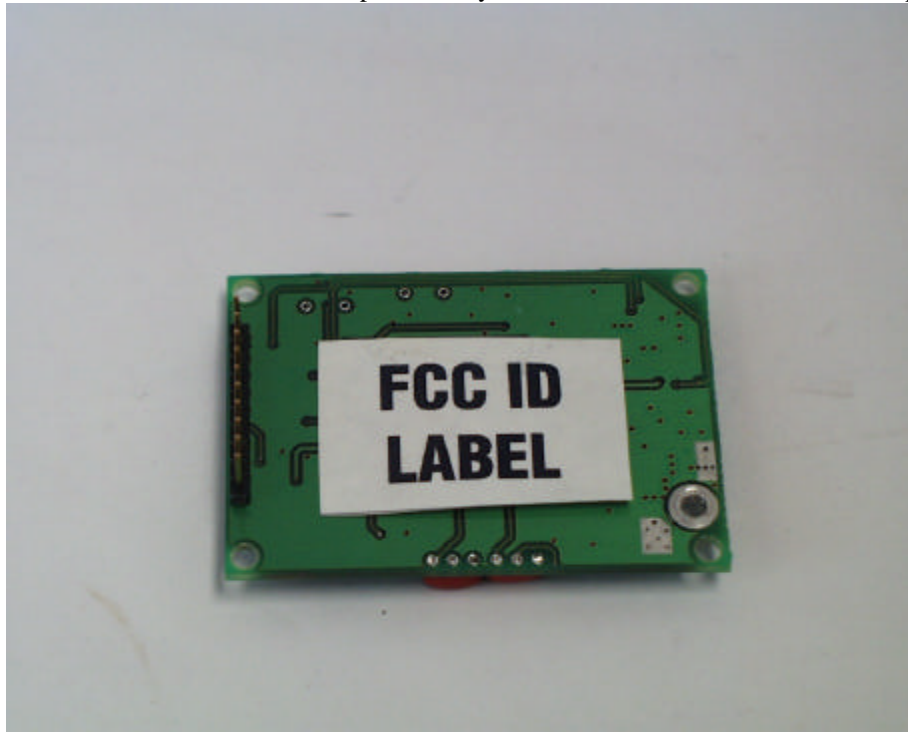
Silk Screen artwork for CDR-915L

The FCC ID information will be permanently silk screened on the solder side of the printed circuit board.