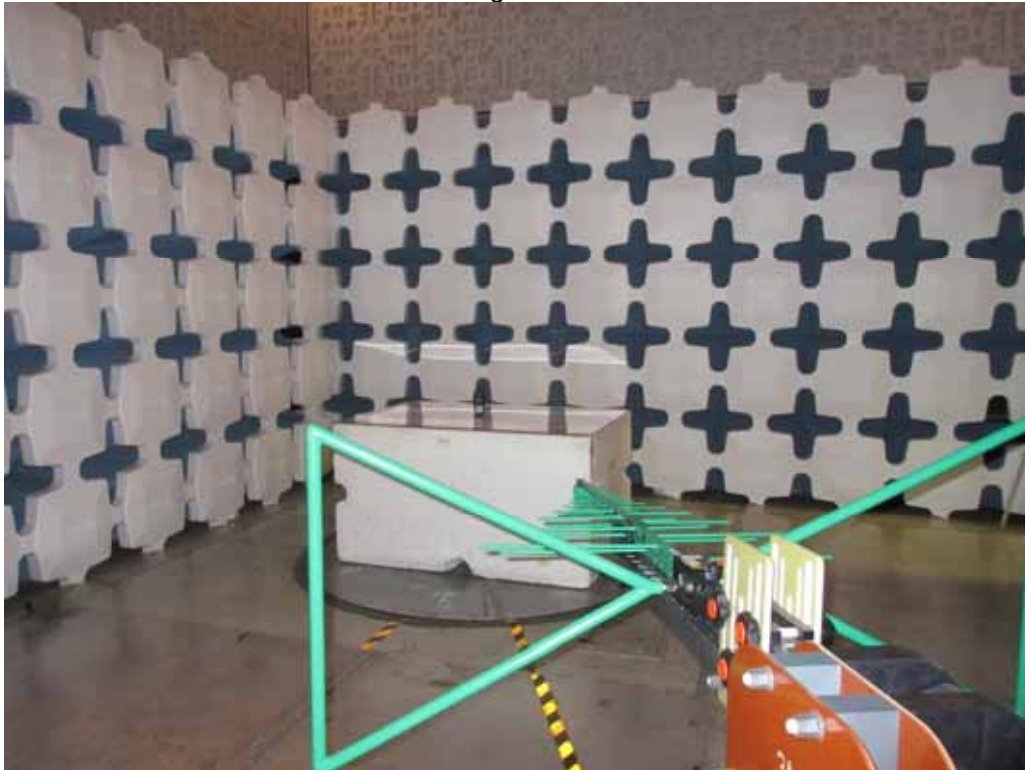
Test Setup for Radiated Emissions above 30MHz – Horizontal Polarization