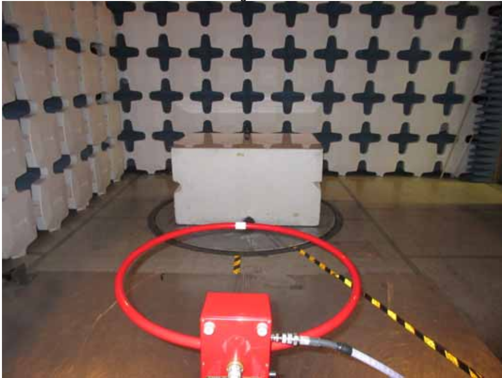
Test Setup for Radiated Emissions below 30MHz – Horizontal Polarization