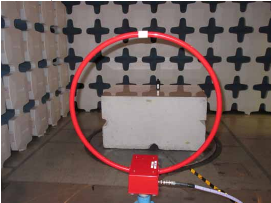
Test Setup for Radiated Emissions below 30MHz – Vertical Polarization