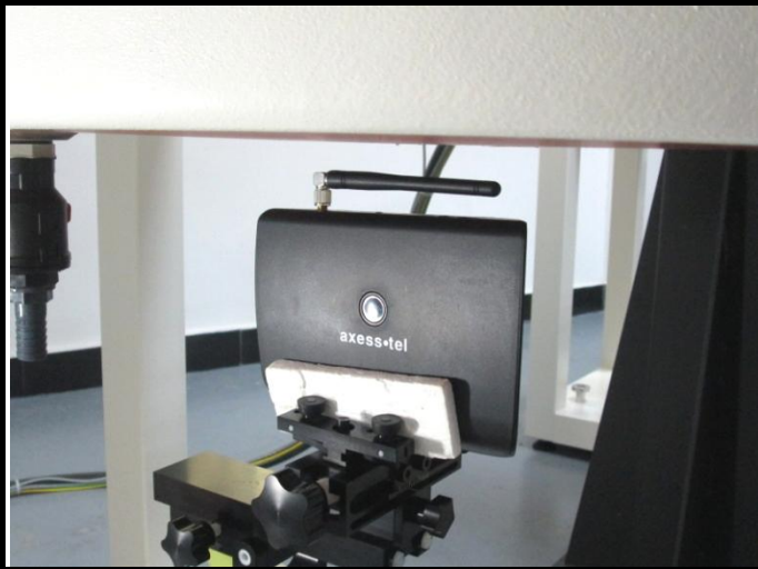
Top Side of EUT with 1.5 cm Gap <Antenna in Horizontal>