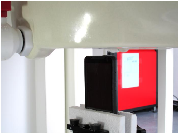
Top Side of EUT with 1 cm Gap