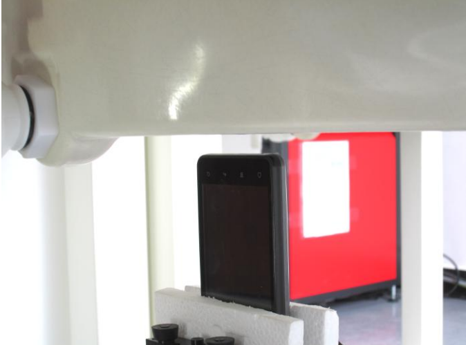
Bottom Side of EUT with 1 cm Gap