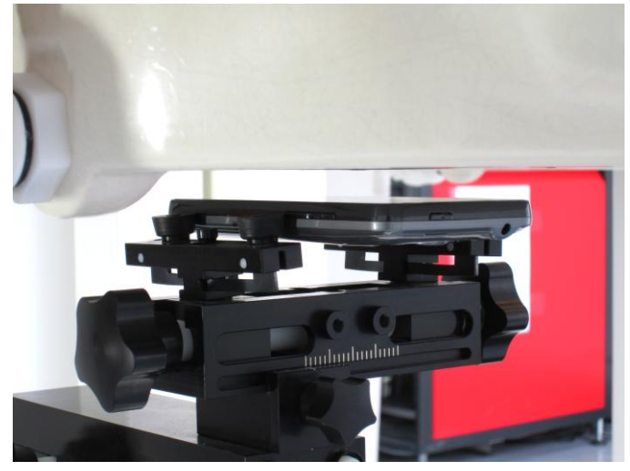
Front Face of EUT with 1 cm Gap