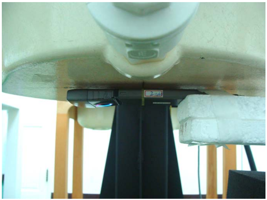
DUT Bottom with Phantom 0.5cm Gap (Antenna in Horizontal Position)