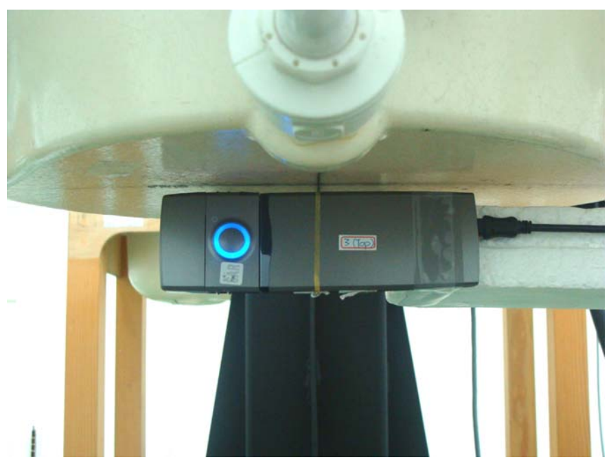
DUT Left Side with Phantom 0.5cm Gap (Antenna in Horizontal Position)