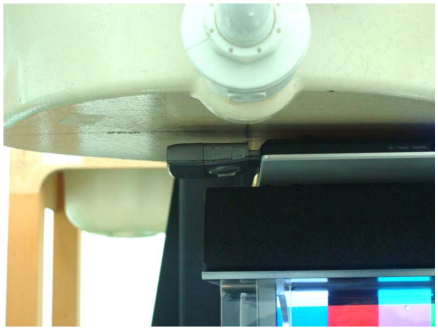
DUT Bottom with Phantom 1cm Gap (Antenna in Horizontal Position)