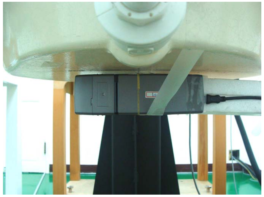
DUT Right Side with Phantom 0.5cm Gap (Antenna in Horizontal Position)