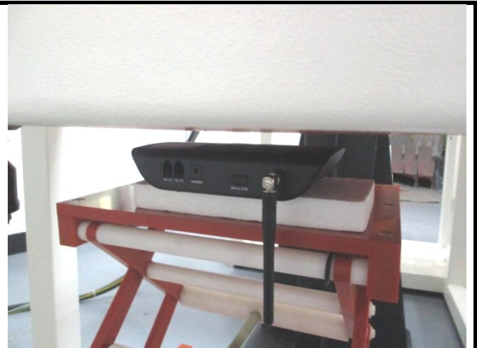
Front Face of EUT with 1.0 cm Gap <Antenna in Vertical>