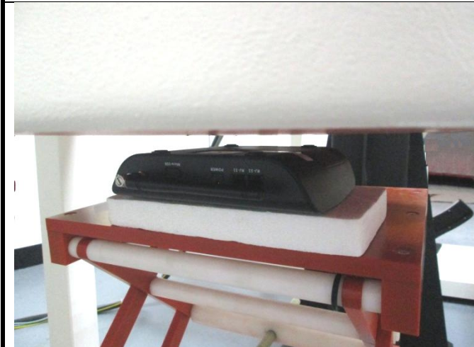
Rear Face of EUT with 1.0 cm Gap <Antenna in Horizontal>