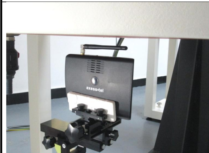
Top Side of EUT with 1.5 cm Gap <Antenna in Horizontal>