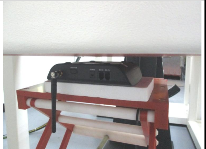
Rear Face of EUT with 1.0 cm Gap <Antenna in Vertical>