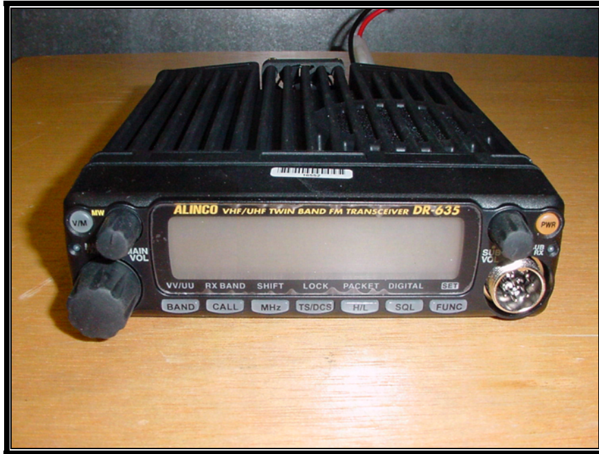
PHOTOGRAPH 5: FRONT AND TOP OF EUT