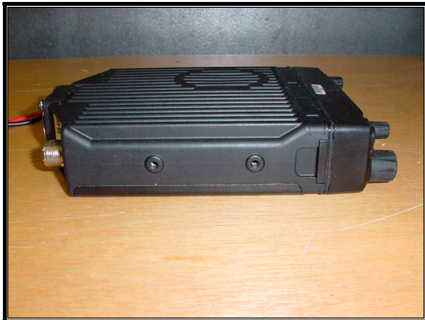
PHOTOGRAPH 8: LEFT SIDE