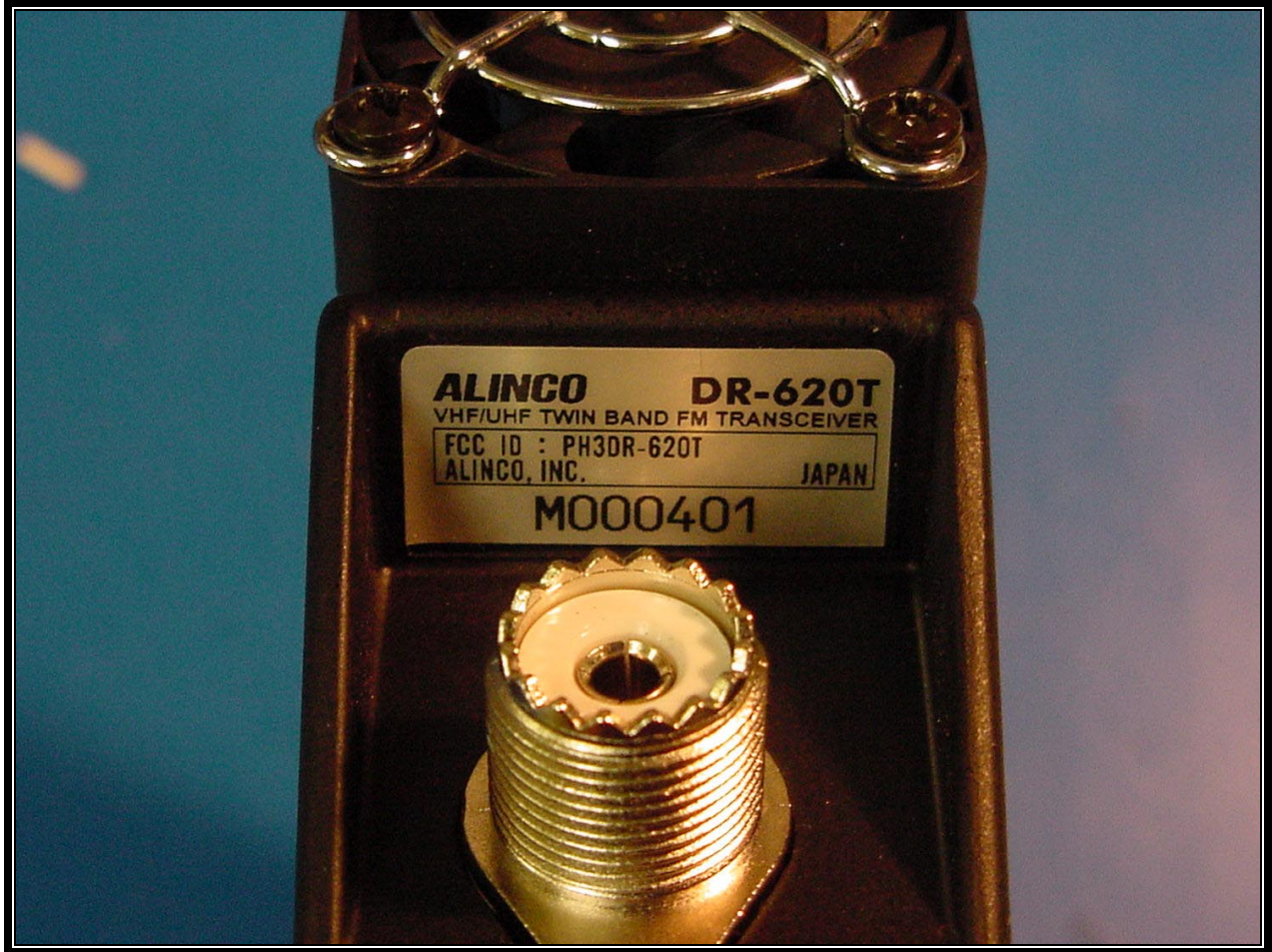
PHOTOGRAPH 2: FCC ID LABEL