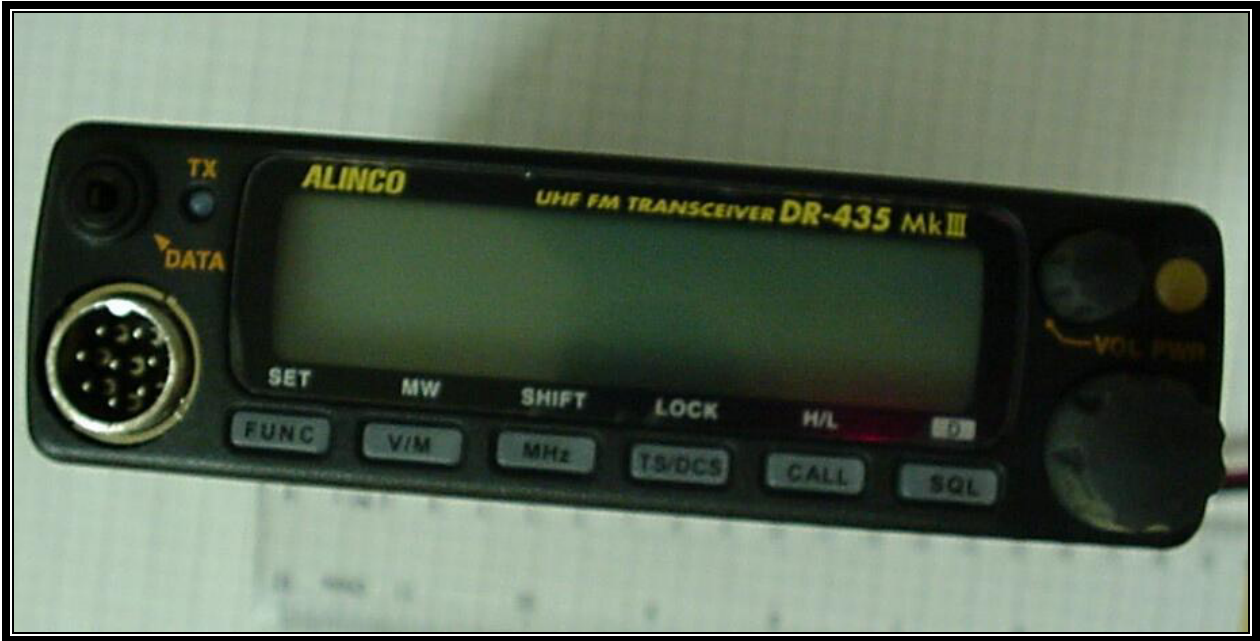
Photograph 5: Front of EUT