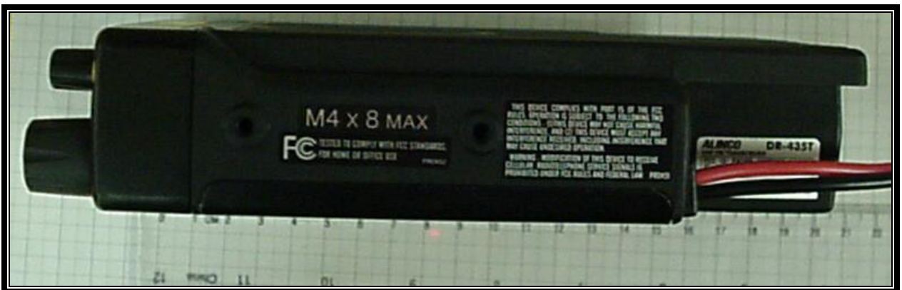
Photograph 10: Right Side