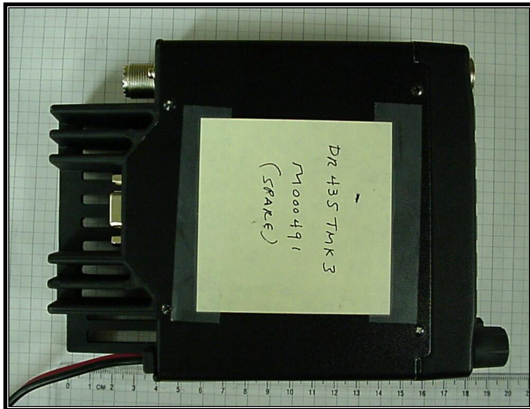
Photograph 8: Bottom of EUT