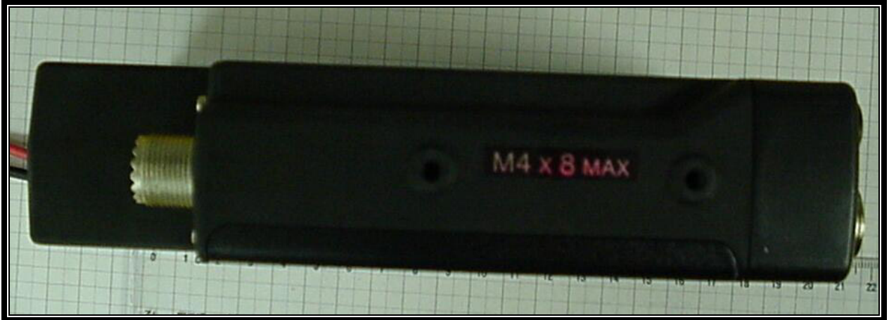
Photograph 9: Left Side