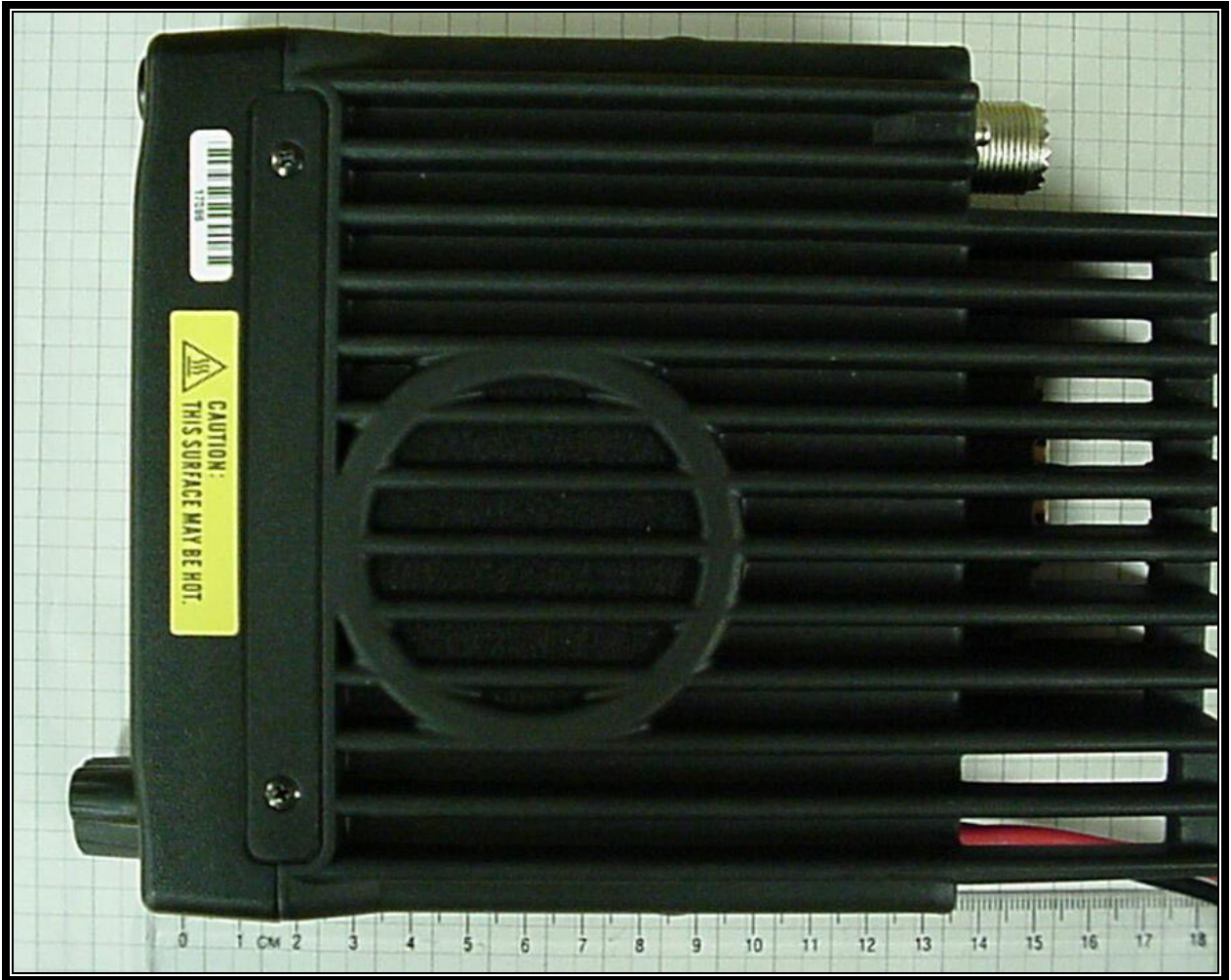
Photograph 6: Top of EUT