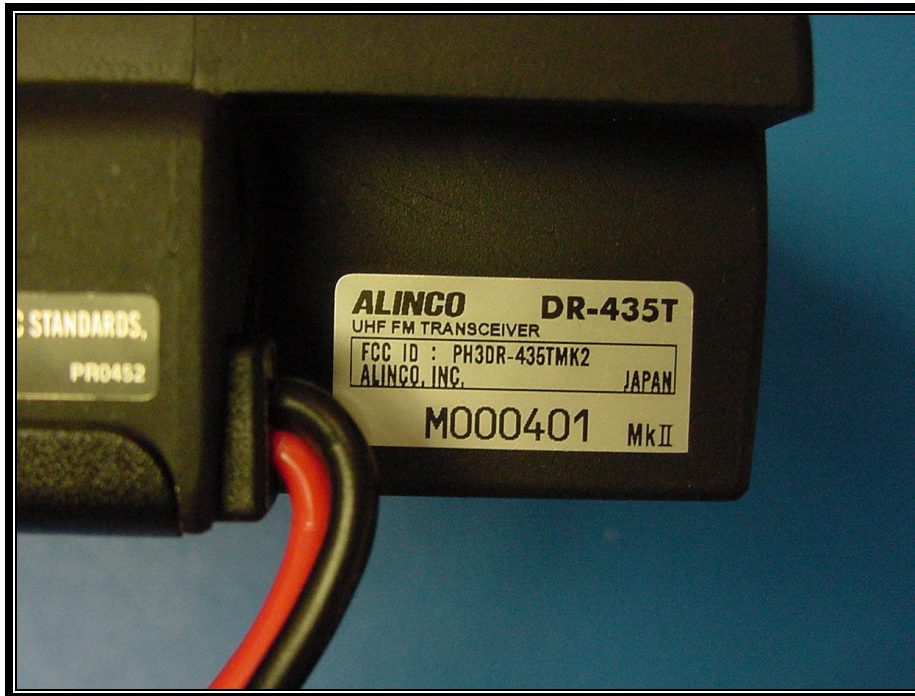
PHOTOGRAPH 2: FCC ID LABEL