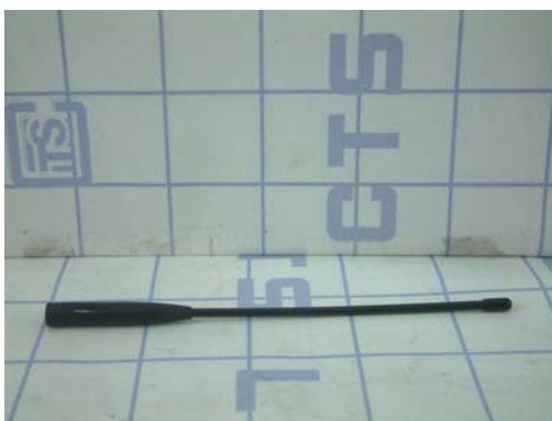
External view-antenna (EA-154)

copyright of this report is owned by Centre of Testing Service and may not be reproduced other than in full except with the written approval of the issuing Company.