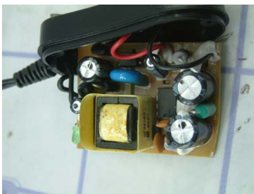
Adapter (EDC-139)-PCB layout

copyright of this report is owned by Centre of Testing Service and may not be reproduced other than in full except with the written approval of the issuing Company.