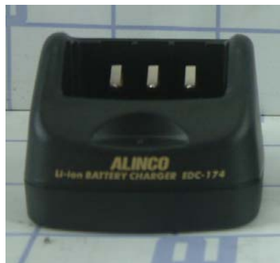
External view-charge (EDC-174)