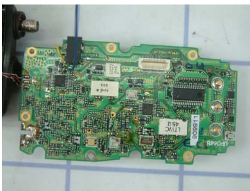
PCB 2 solder