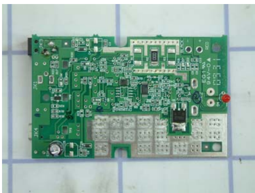
Charge (EDC-174)-PCB layout