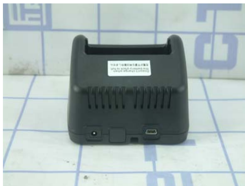
External view-charge (EDC-174)

copyright of this report is owned by Centre of Testing Service and may not be reproduced other than in full except with the written approval of the issuing Company.