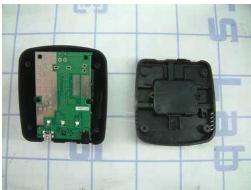
Internal view-charge (EDC-174)