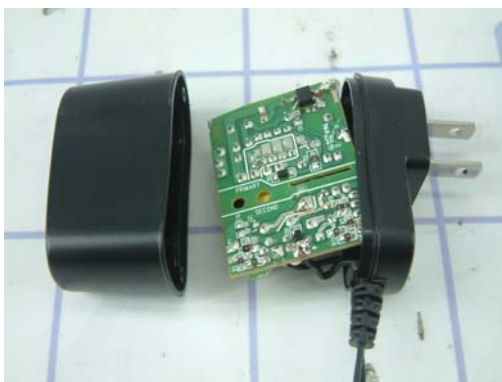
Internal view-adapter (EDC-139)