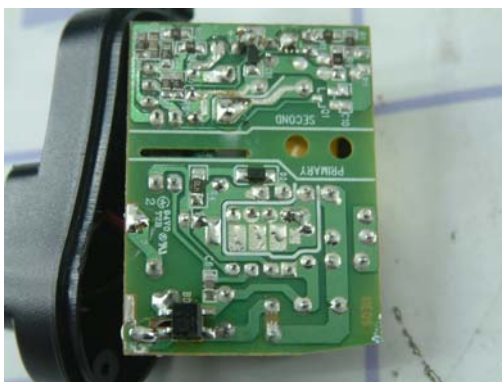
Adapter (EDC-139)-PCB solder

copyright of this report is owned by Centre of Testing Service and may not be reproduced other than in full except with the written approval of the issuing Company.