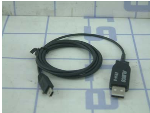
External view- USB cable (ERW-8 )