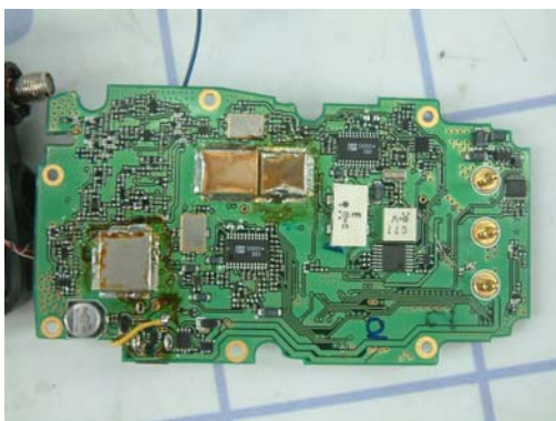
PCB 2 layout