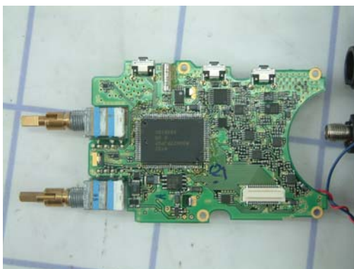
PCB 1 layout