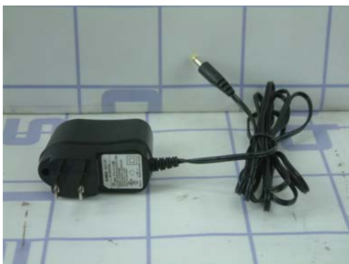
External view-adapter (EDC-139)