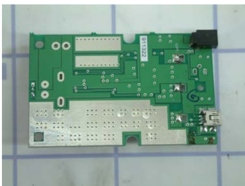
Charge (EDC-174)-PCB solder

copyright of this report is owned by Centre of Testing Service and may not be reproduced other than in full except with the written approval of the issuing Company.