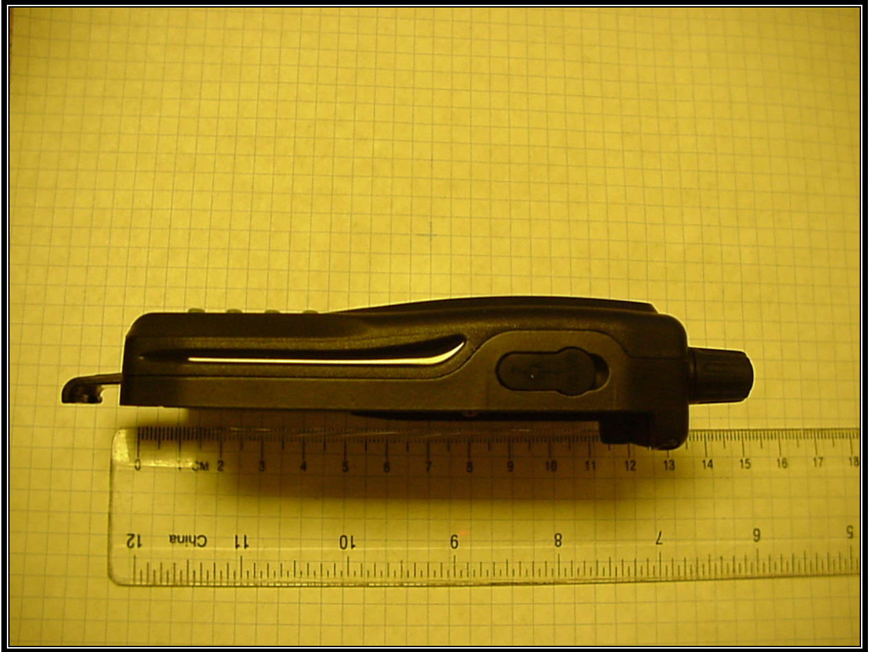
Photograph 10: Right Side View