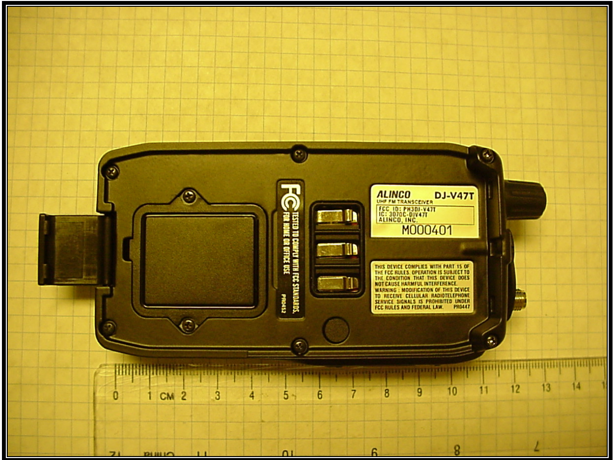
Photograph 9: Back View