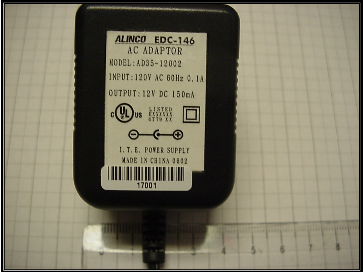
Photograph 14: EDC-146 AC Adapter Top View