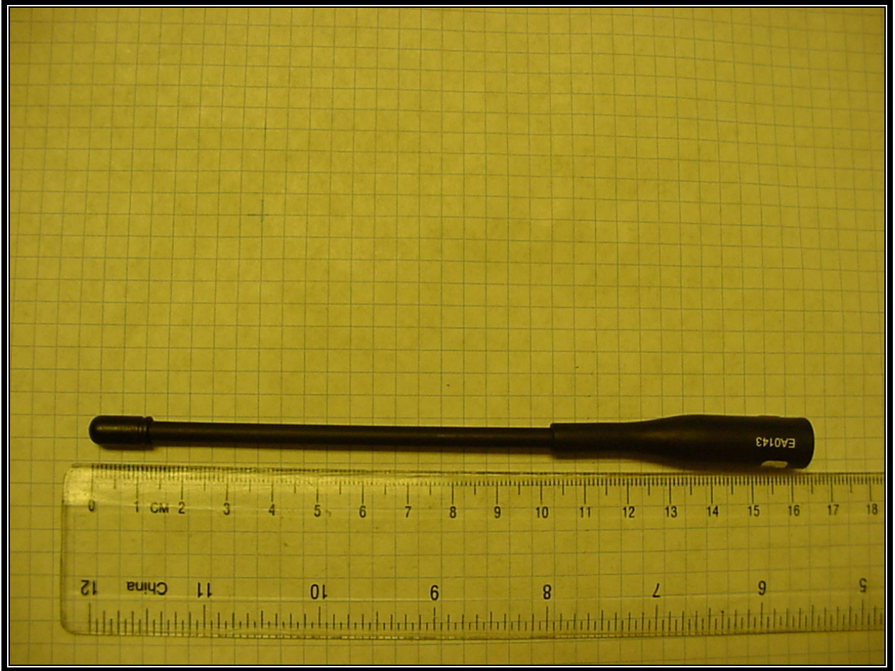
Photograph 17: Antenna