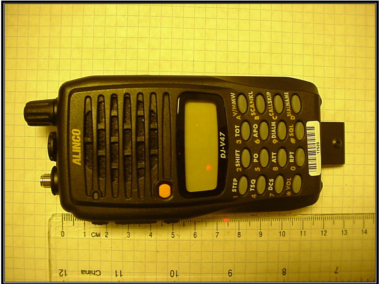
Photograph 8: Front View