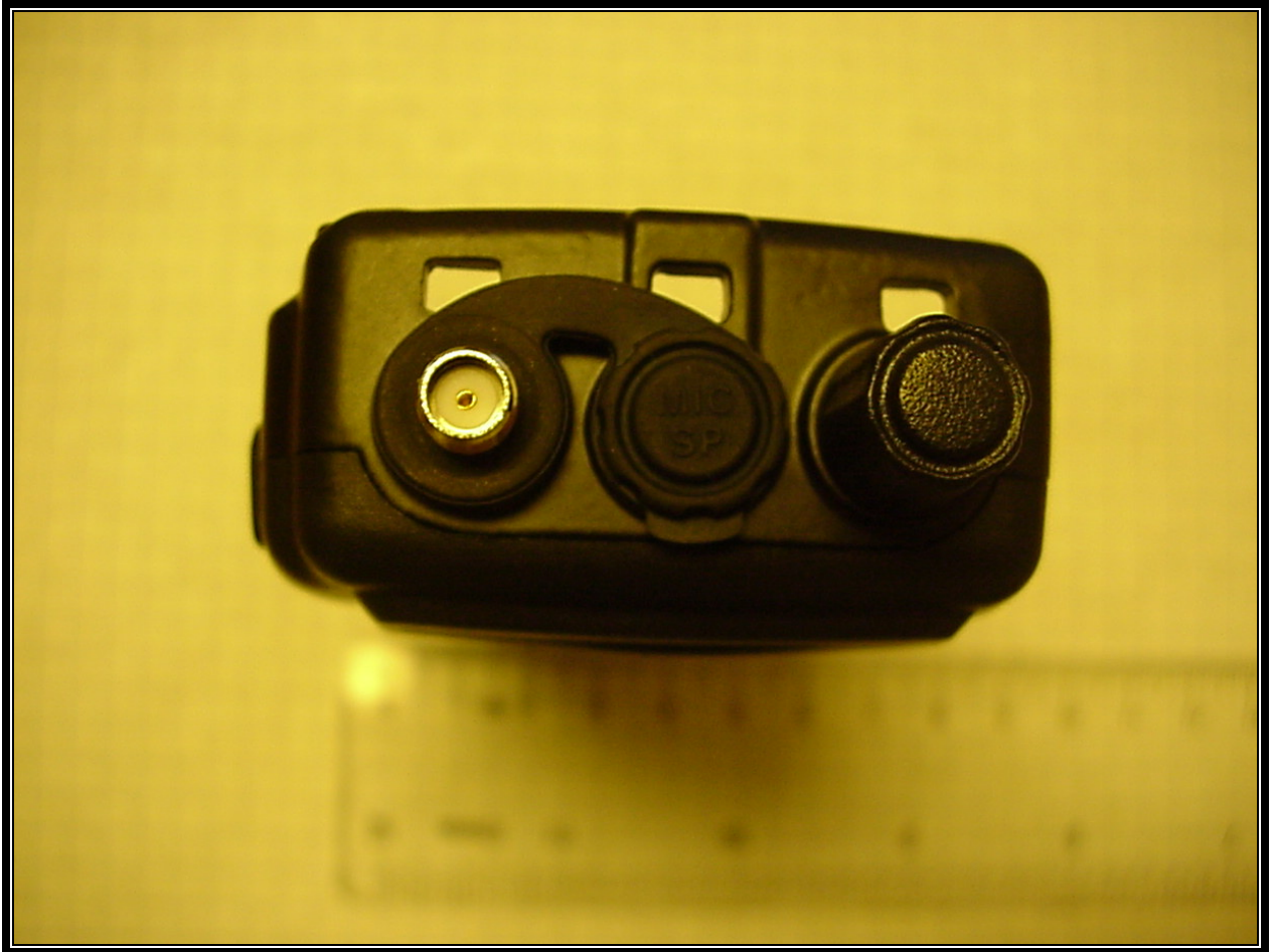
Photograph 12: Top View