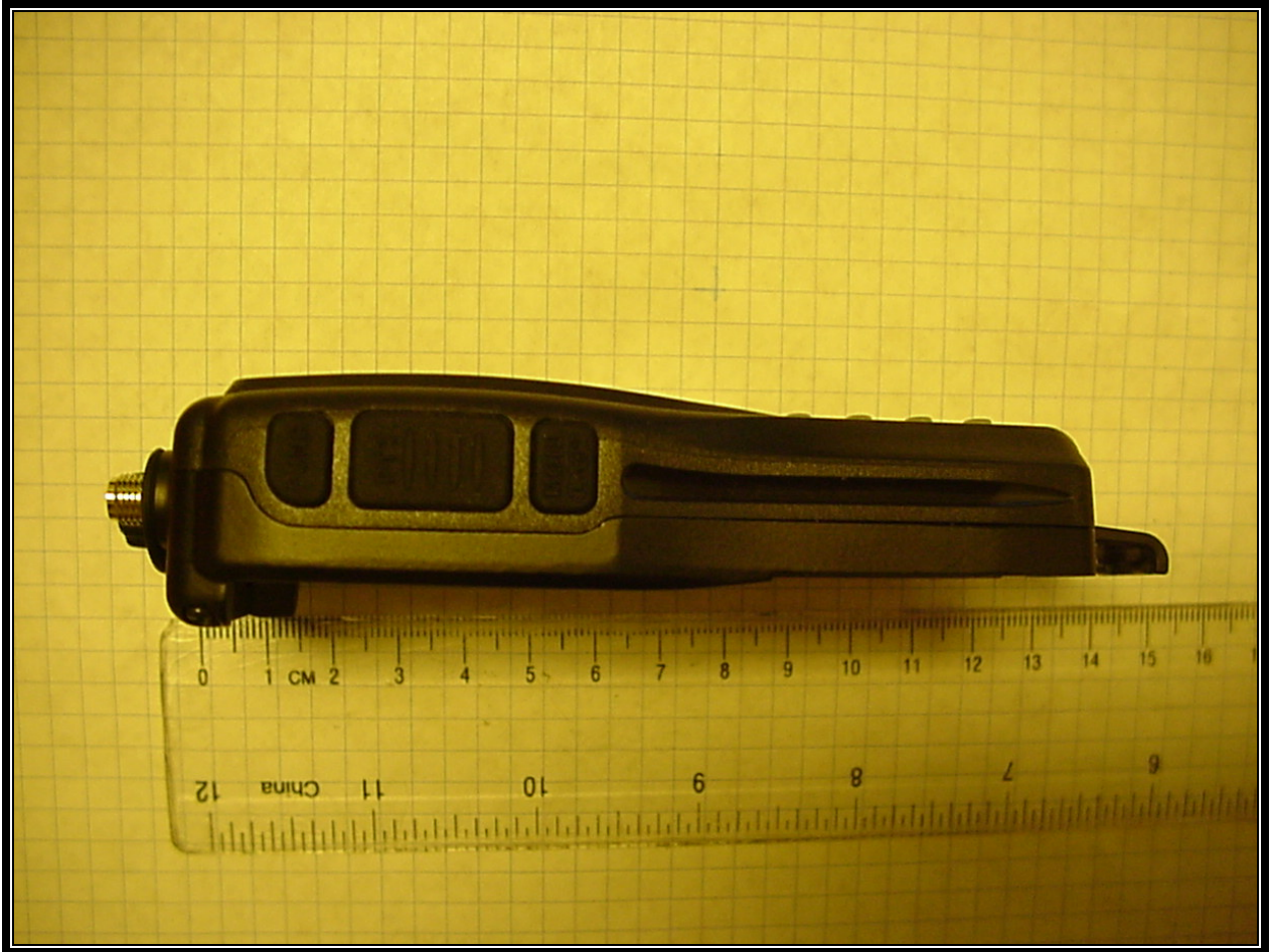
Photograph 11: Left Side View