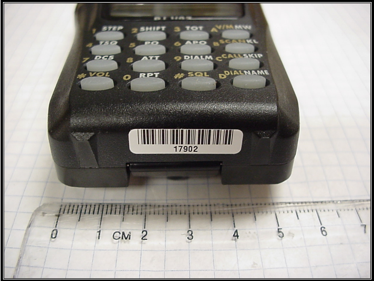
Photograph 13: Bottom View