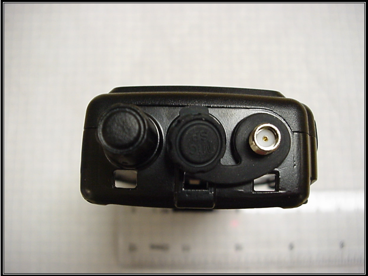
Photograph 12: Top View