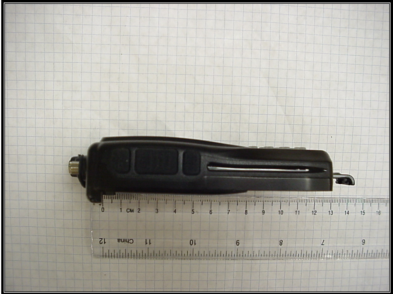
Photograph 11: Left Side View