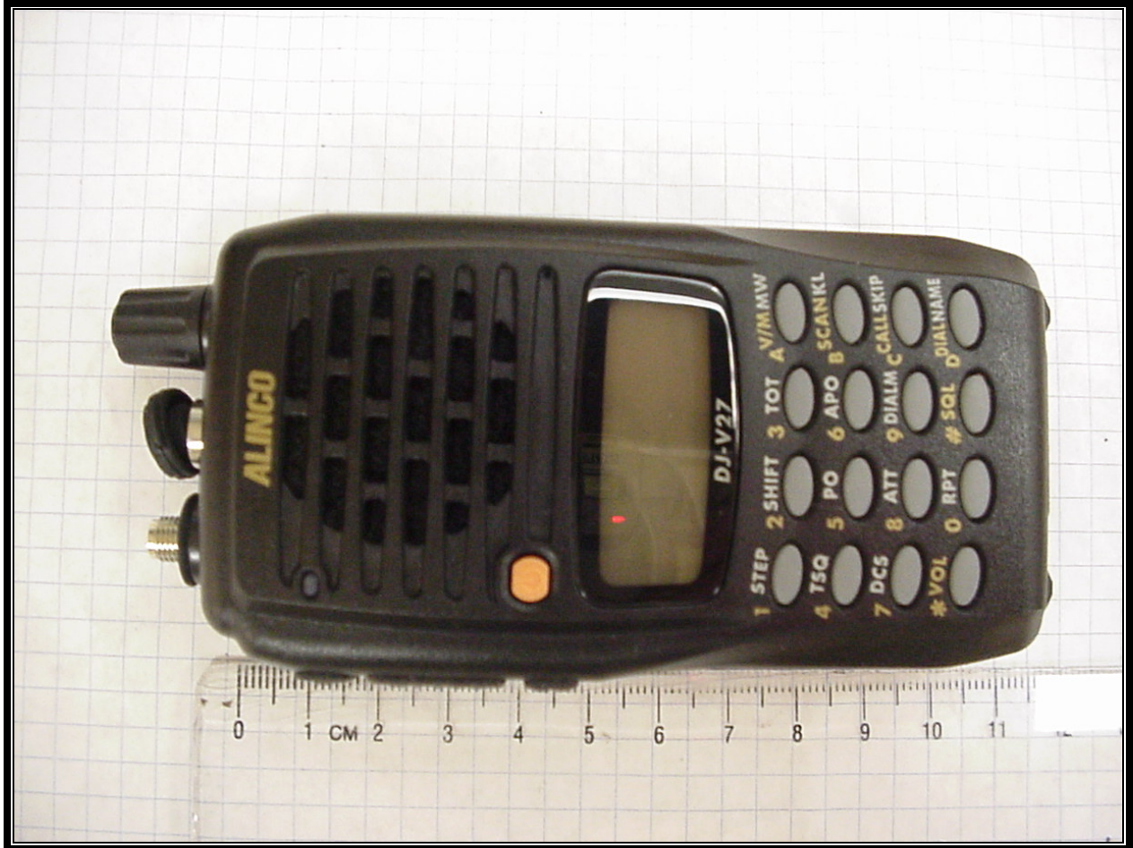
Photograph 8: Front View