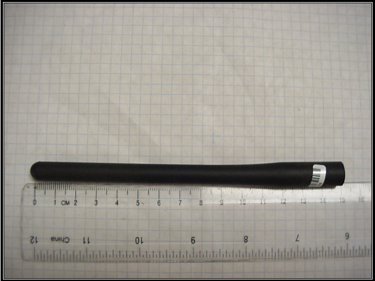
Photograph 17: Antenna