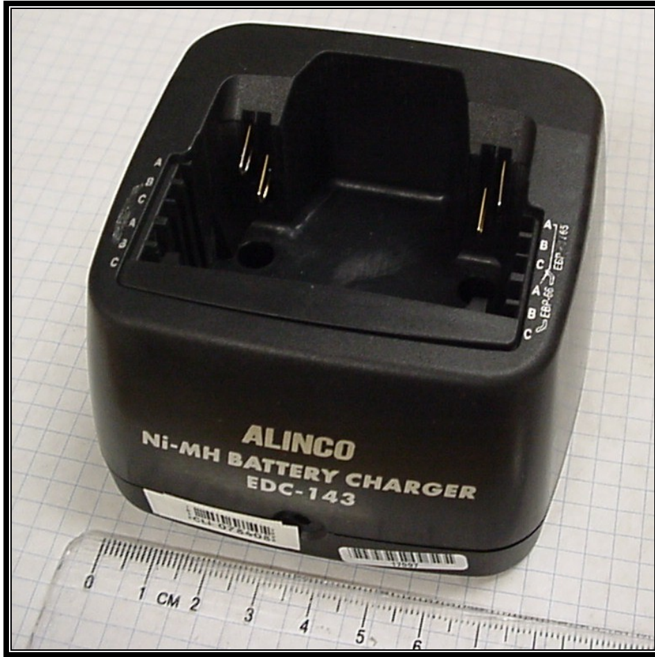
Photograph 18: EDC-143 Battery Charger