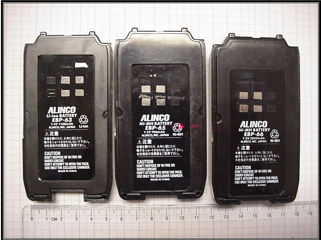
Photograph 15: EBP-63, EBP-65, EBP-66 Battery Labels