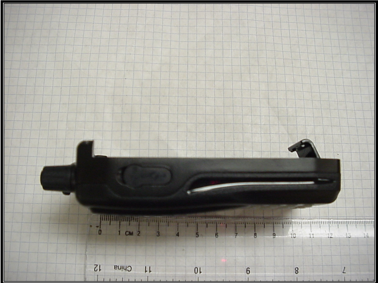
Photograph 10: Right Side View