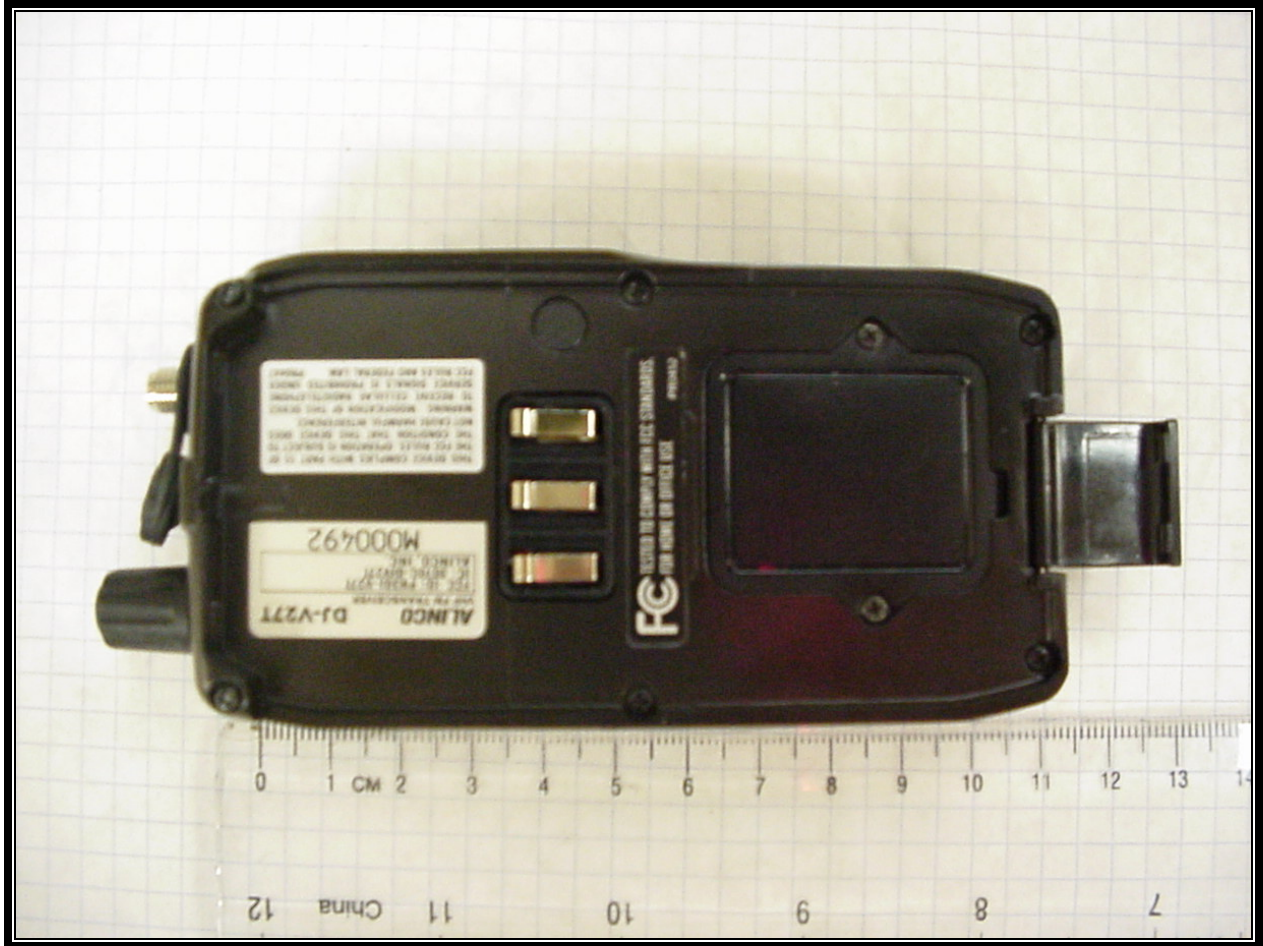
Photograph 9: Back View