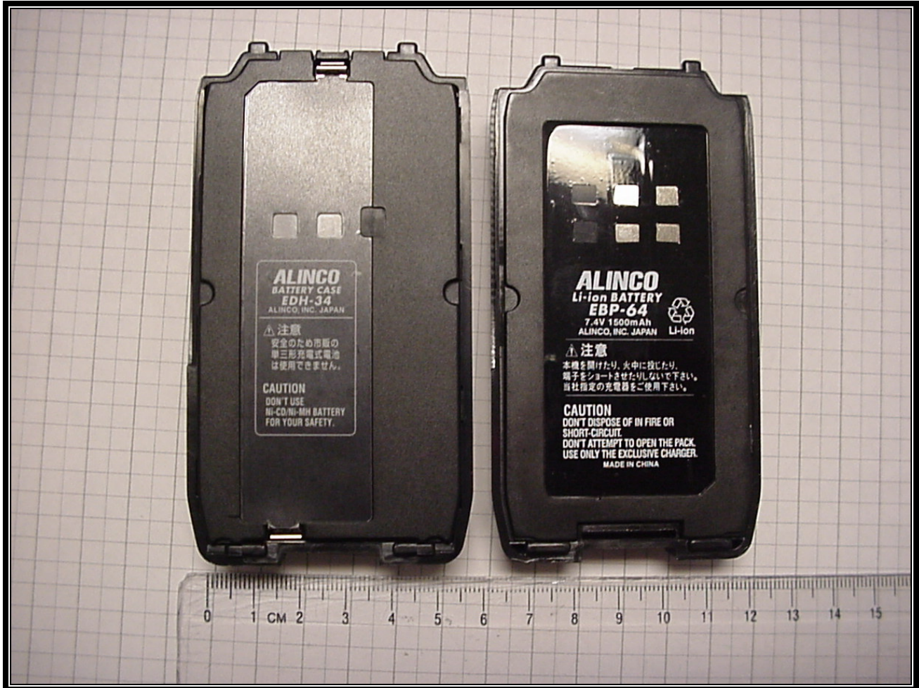
Photograph 16: EDH-34, EBP-64 Battery Labels