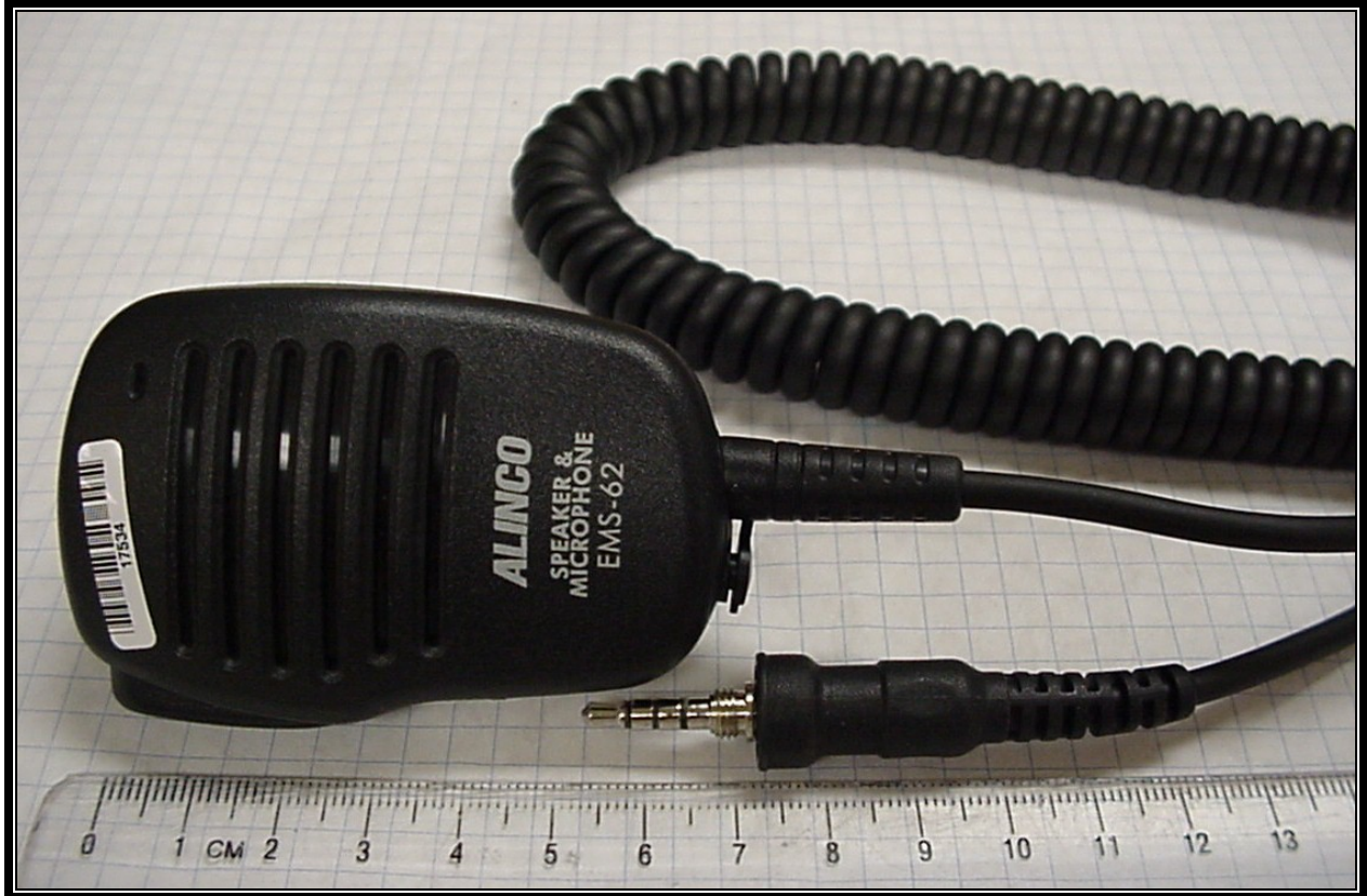
Photograph 19: EMS-62 Speaker & Microphone