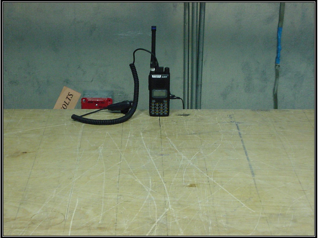
PHOTOGRAPH 2: CONDUCTED TEST CONFIGURATION (FRONT VIEW)