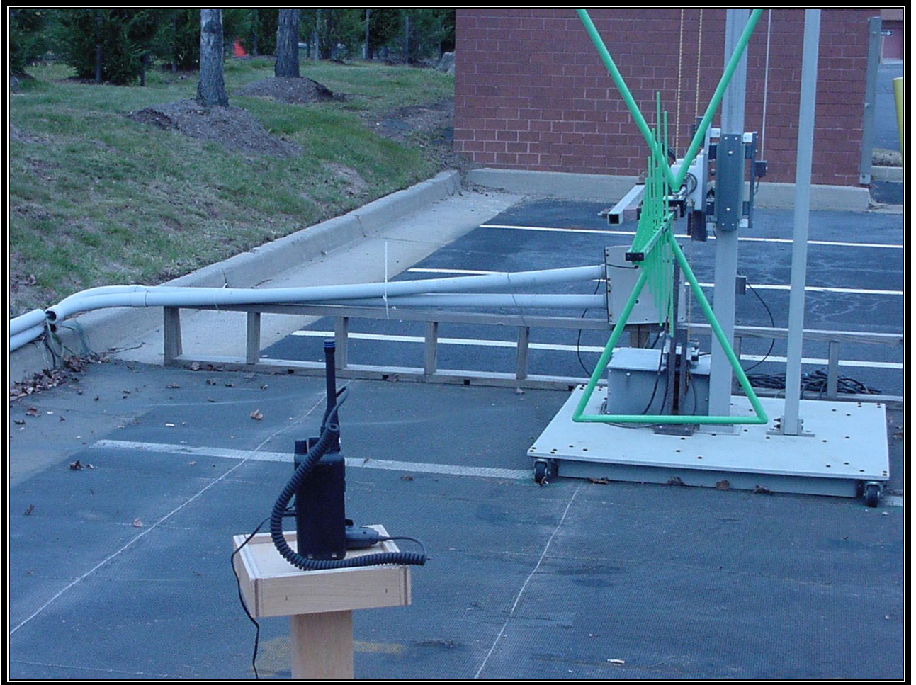
PHOTOGRAPH 5: RADIATED TEST CONFIGURATION (REAR VIEW)