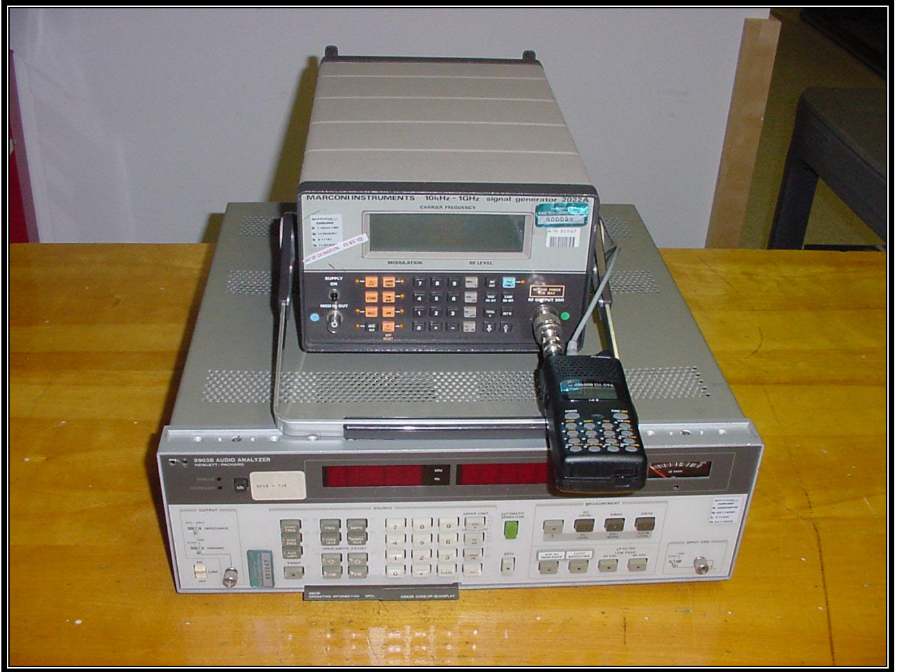
PHOTOGRAPH 6: 38 DB REJECTION SETUP