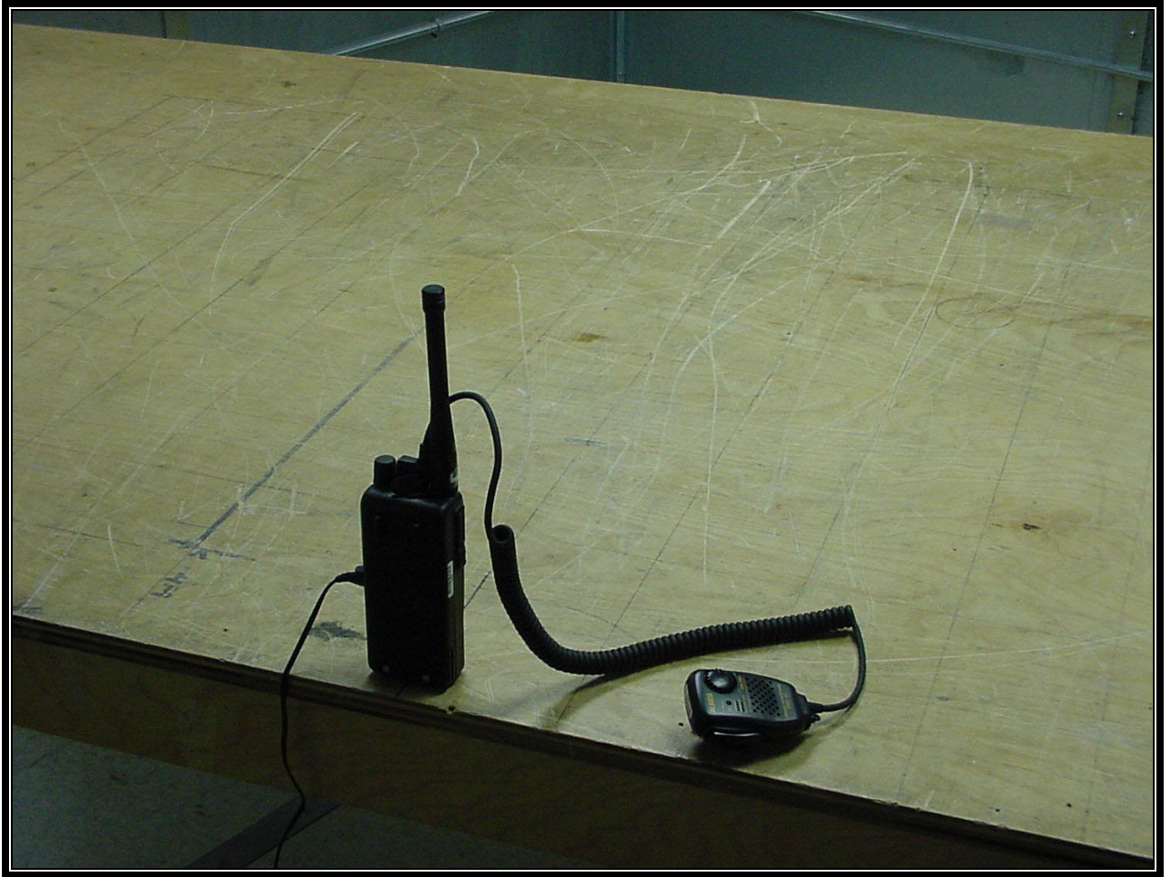
PHOTOGRAPH 3: CONDUCTED TEST CONFIGURATION (REAR VIEW)