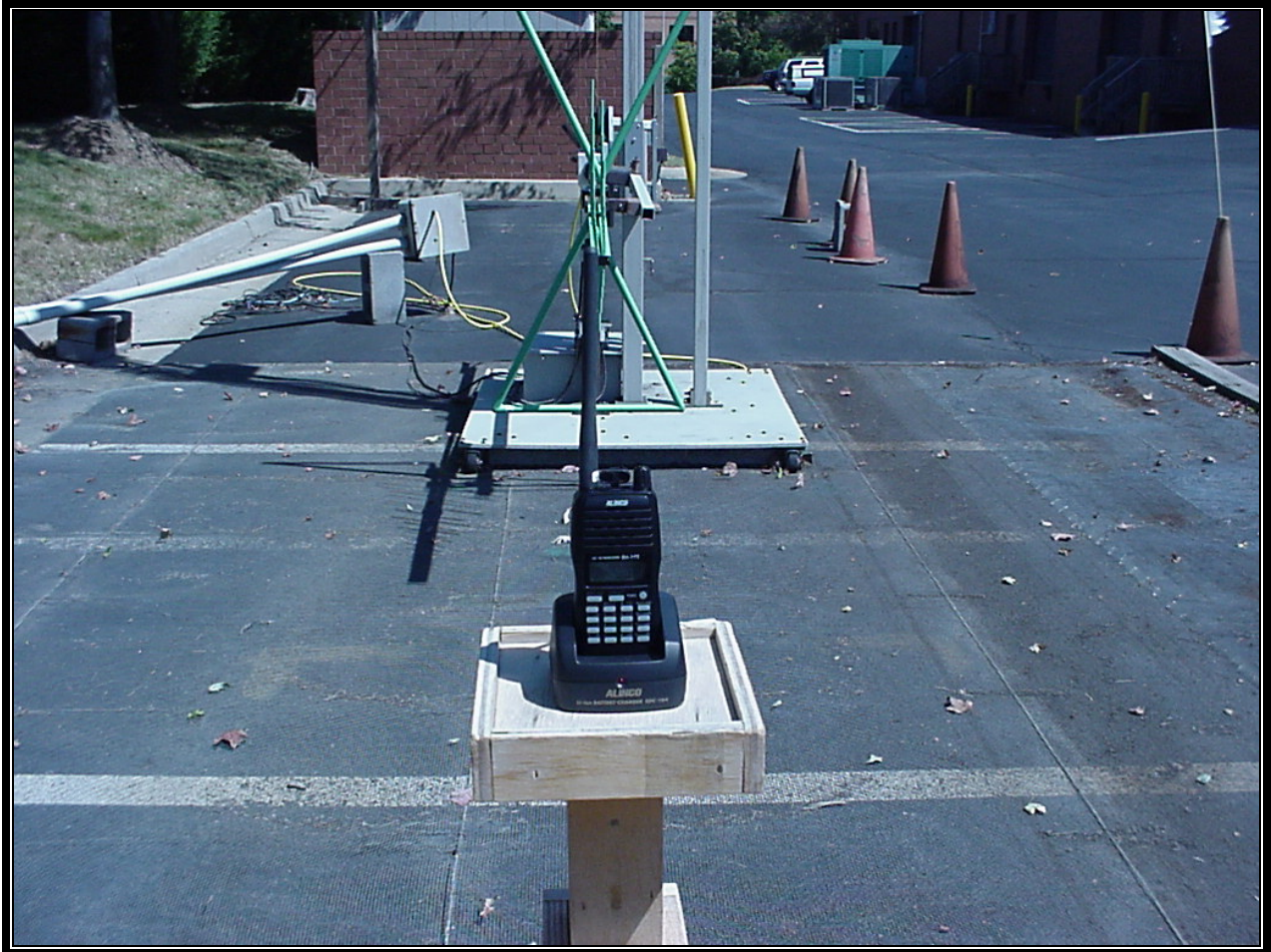
Photograph 3: Radiated Emissions Test Configuration (Front View)