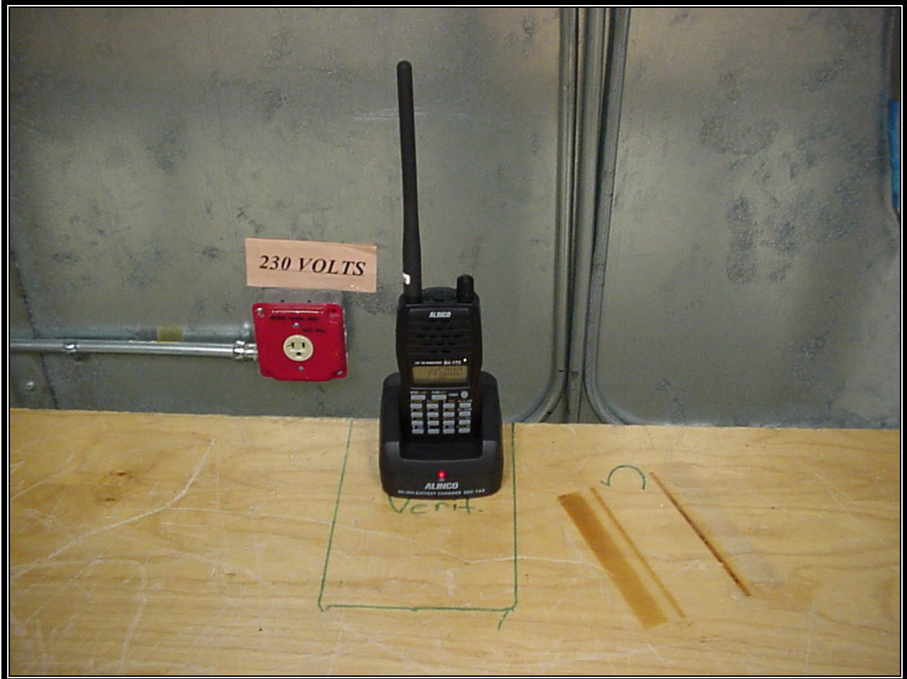
Photograph 6: Conducted AC Emissions Test Configuration (Front View)