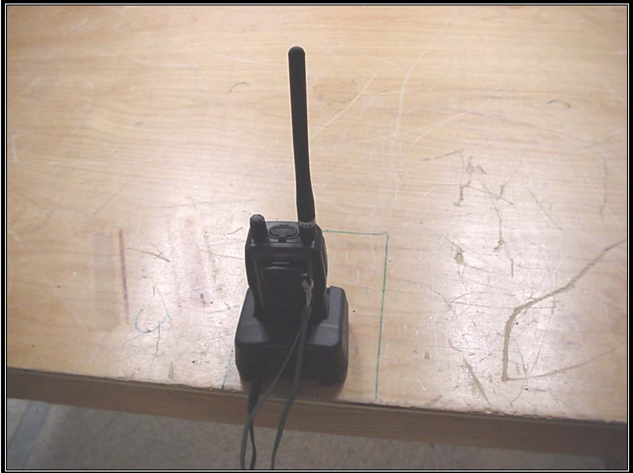
Photograph 7: Conducted AC Emissions Test Configuration (Rear View)