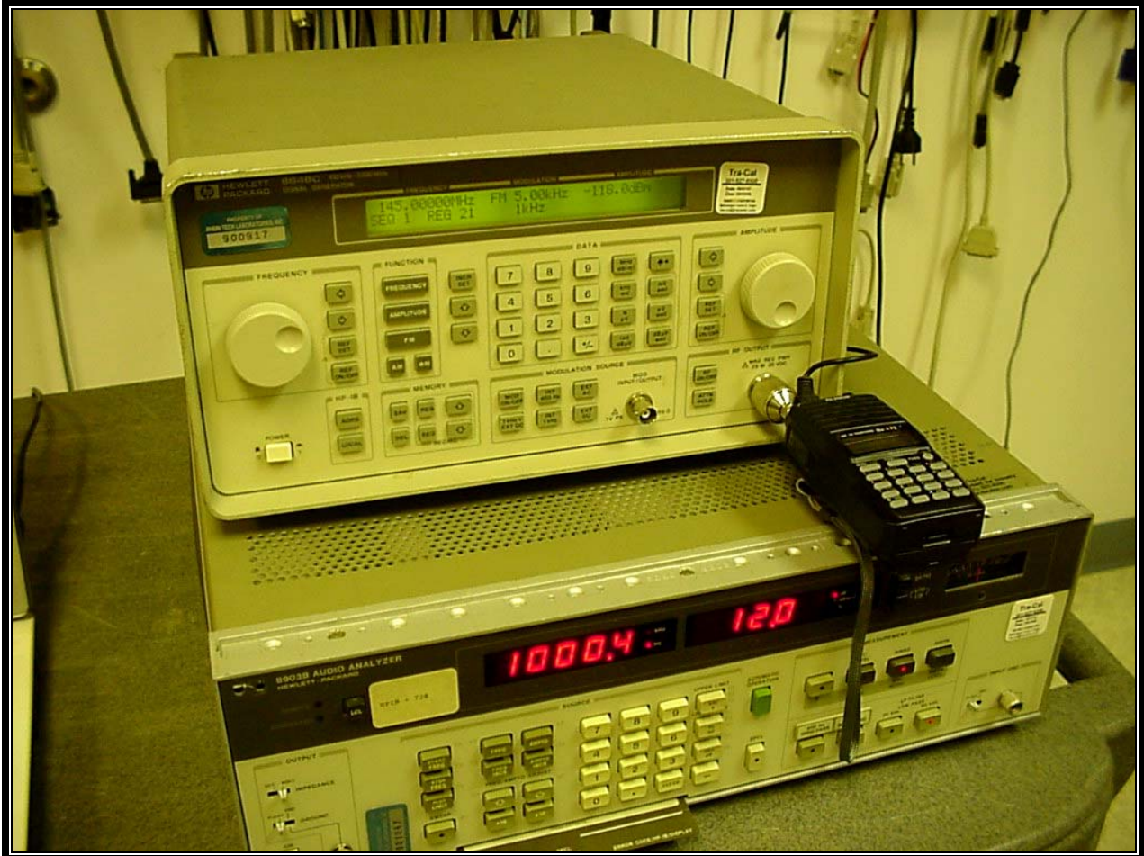
Photograph 5: 38 dB Rejection Test Configuration