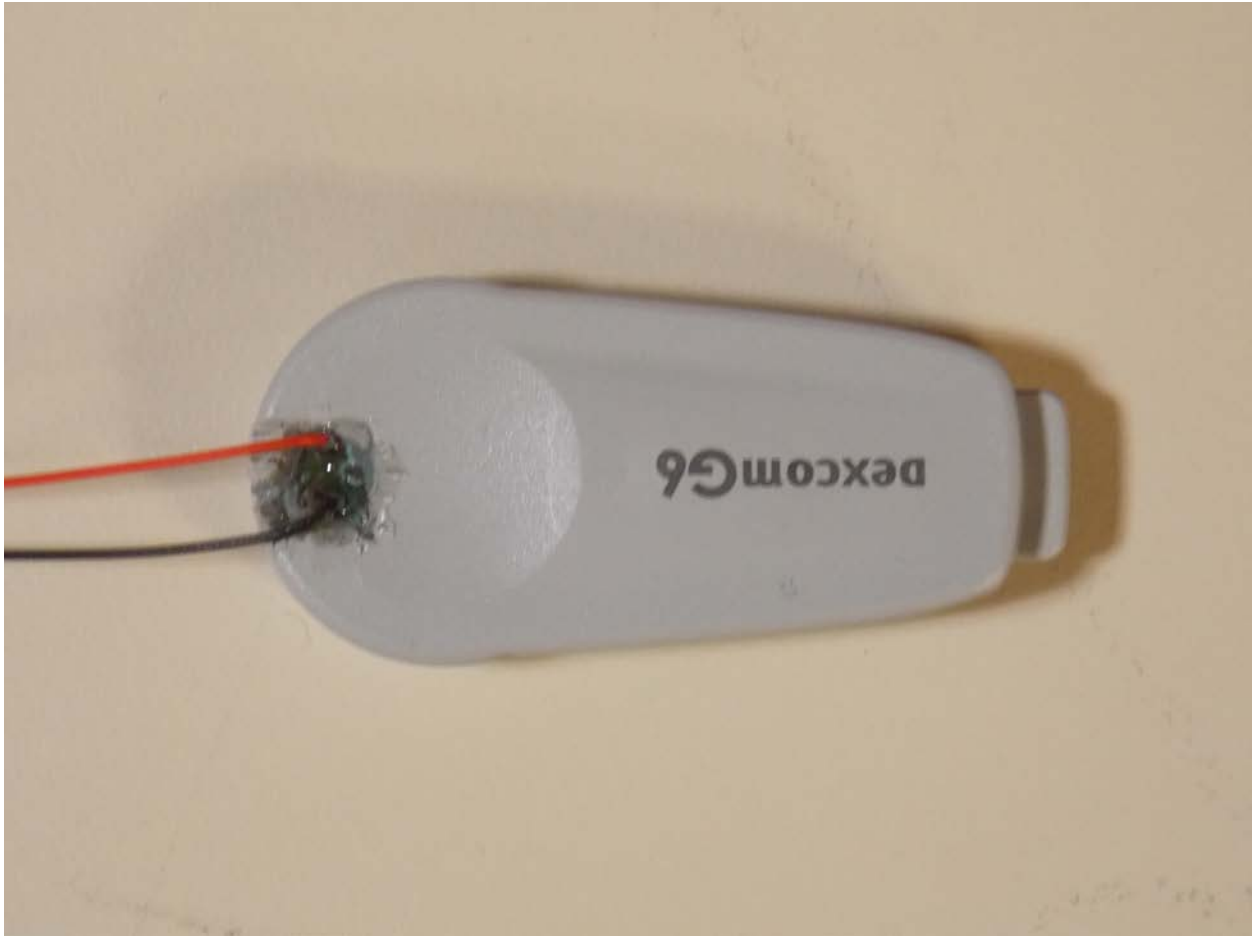
Front of Device