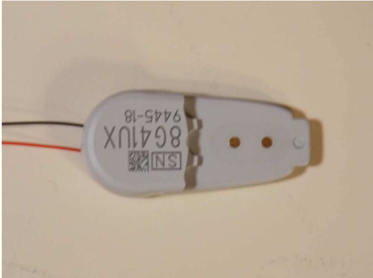
Back of Device