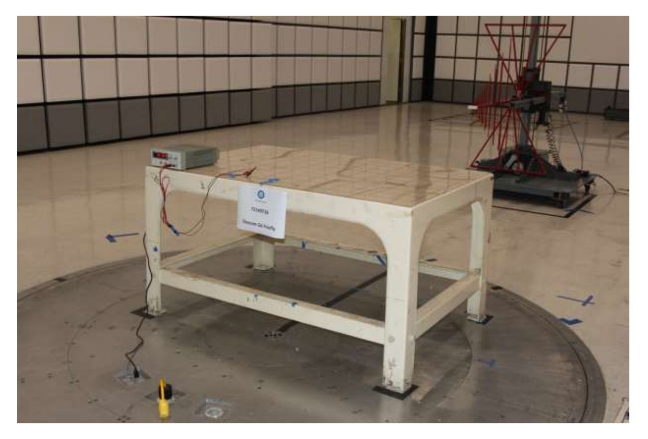
Radiated Emissions Test Setup (below 30MHz)