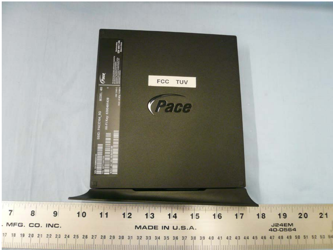
Figure 4: External Photo of EUT – Right Side