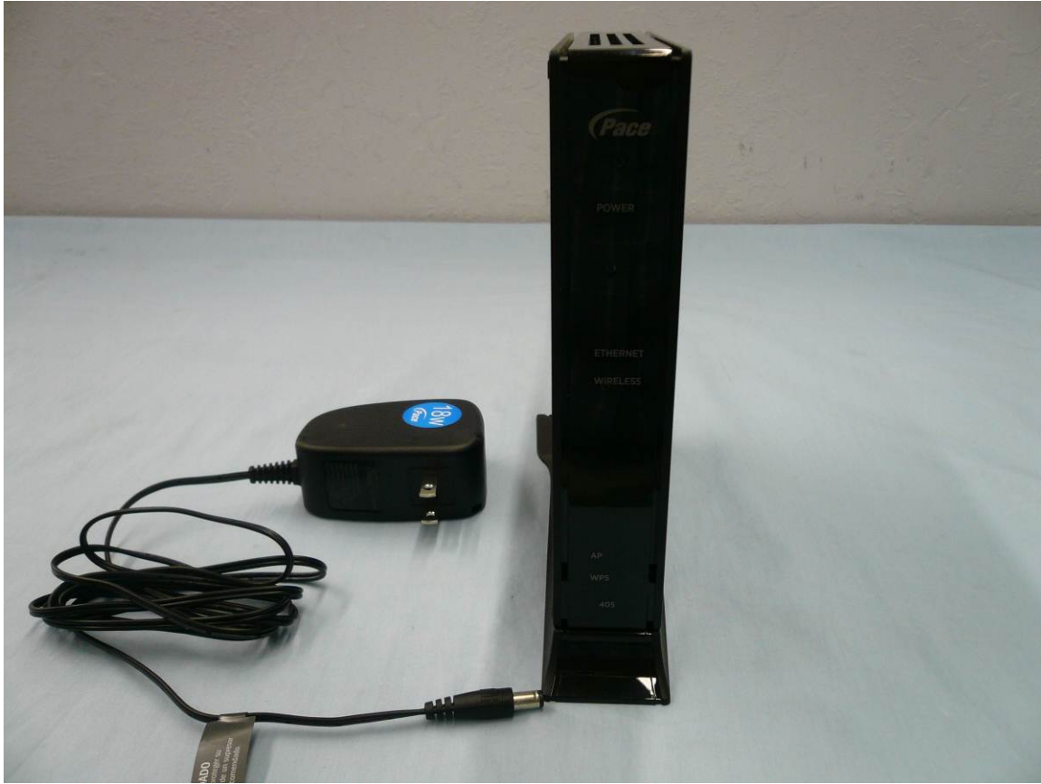
Figure 1: External Photo of EUT - Front