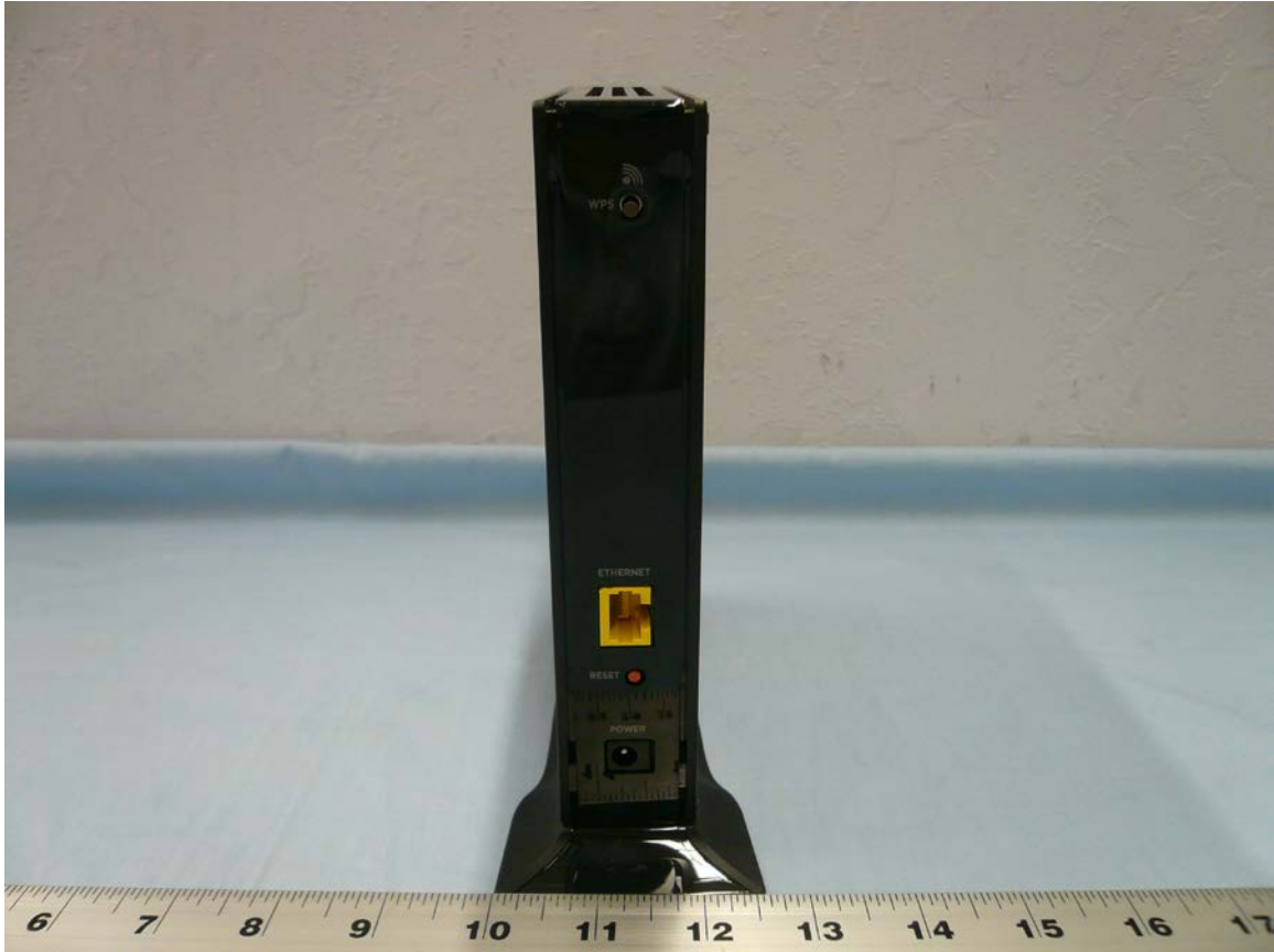
Figure 2: External Photo of EUT – Rear View