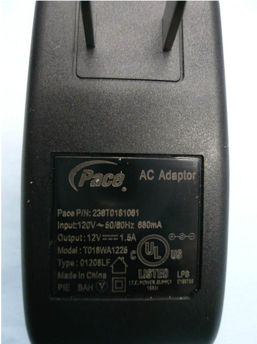
Figure 5: External Photo of EUT – AC Adapter Label