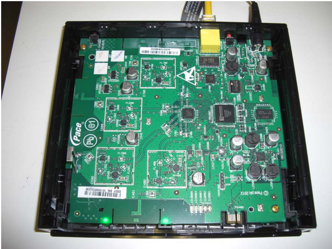
Figure 3: Chipset Photo without RF Shielding