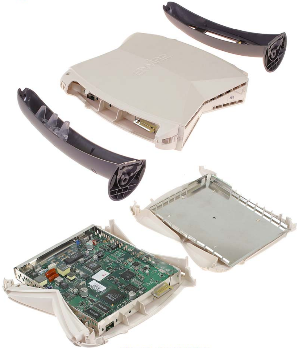
Figure 3 - Assembly Views