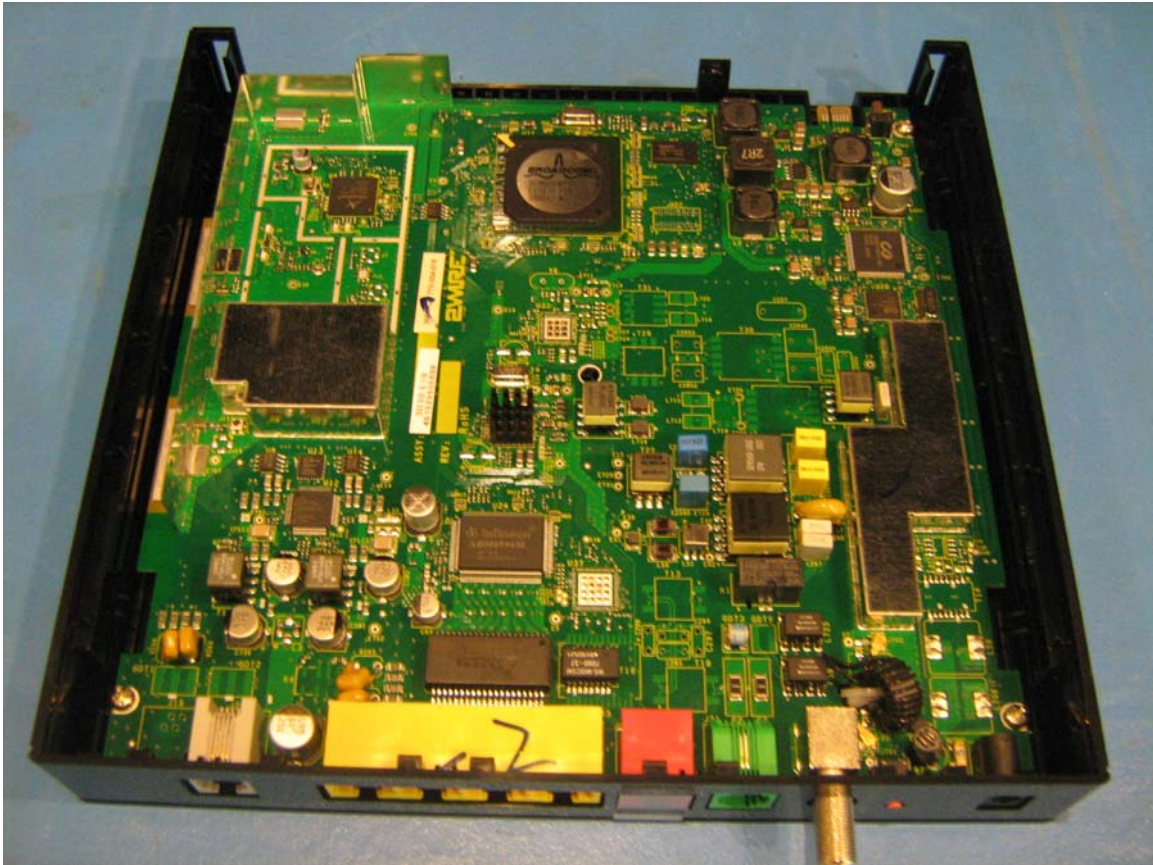
Figure 3: Internal Photo of HomePortal 3801HGV - PCB Board (inside Plastic Housing)