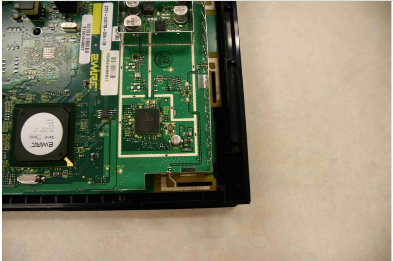
Figure 7: Internal Photo of HomePortal 3801HGV - PCB Shields removed