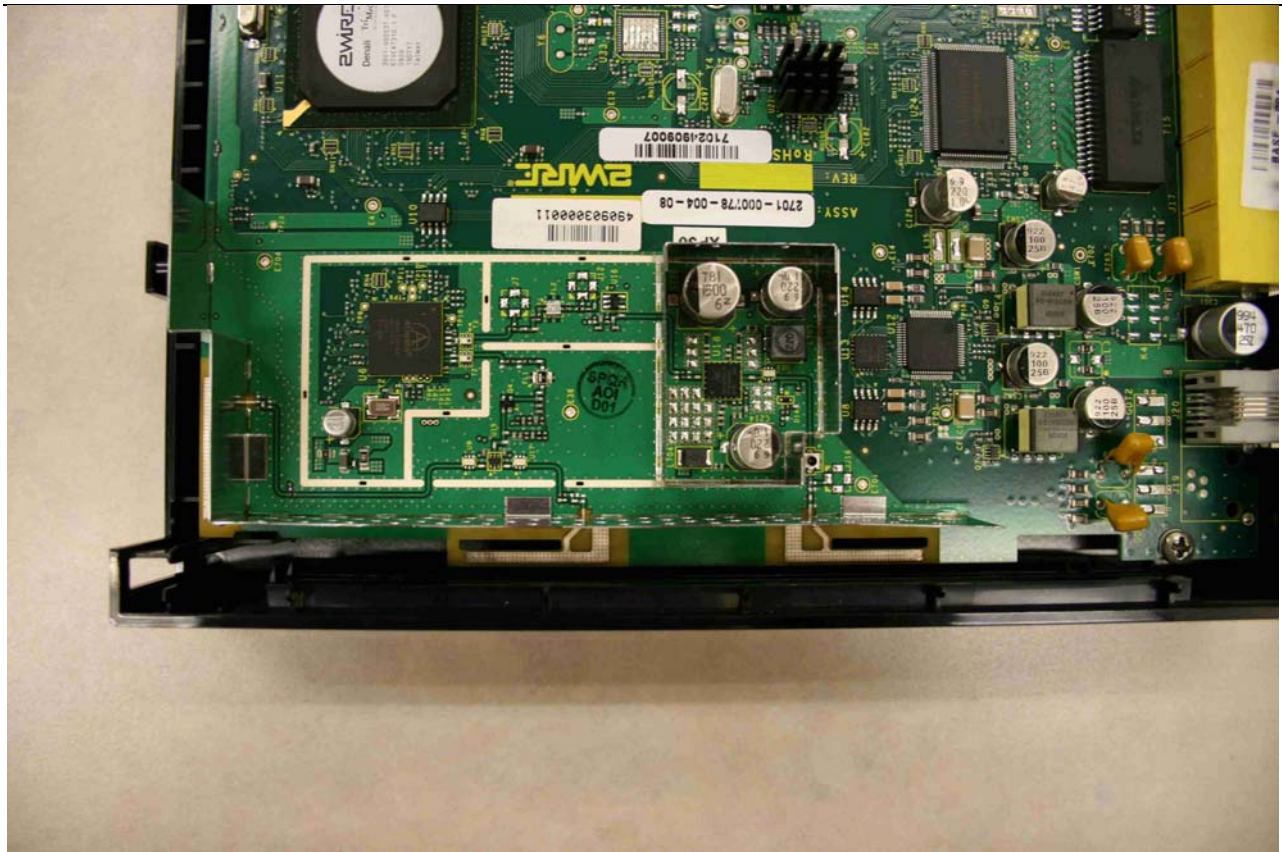
Figure 4: Internal Photo of HomePortal 3801HGV - PCB Shields removed