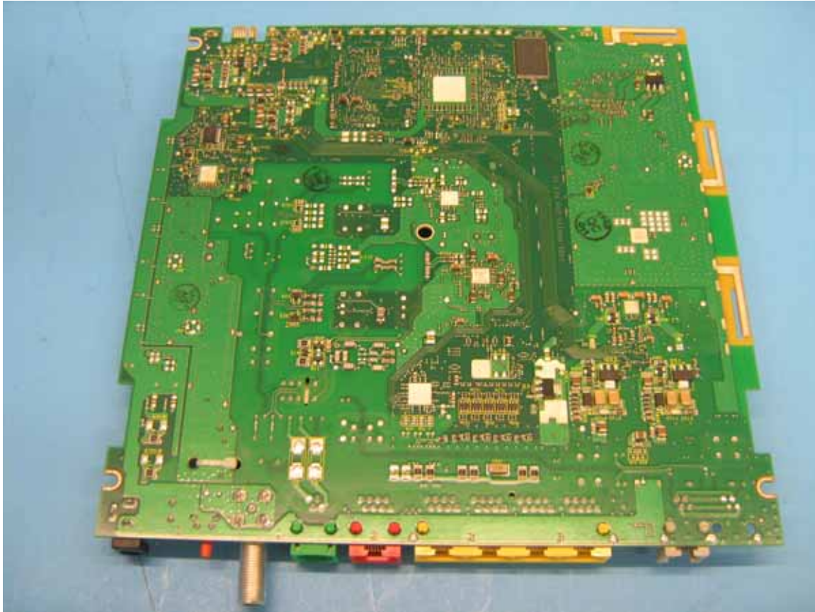
Figure 2: Internal Photo of HomePortal 3801HGV - PCB Board (Rear Side)