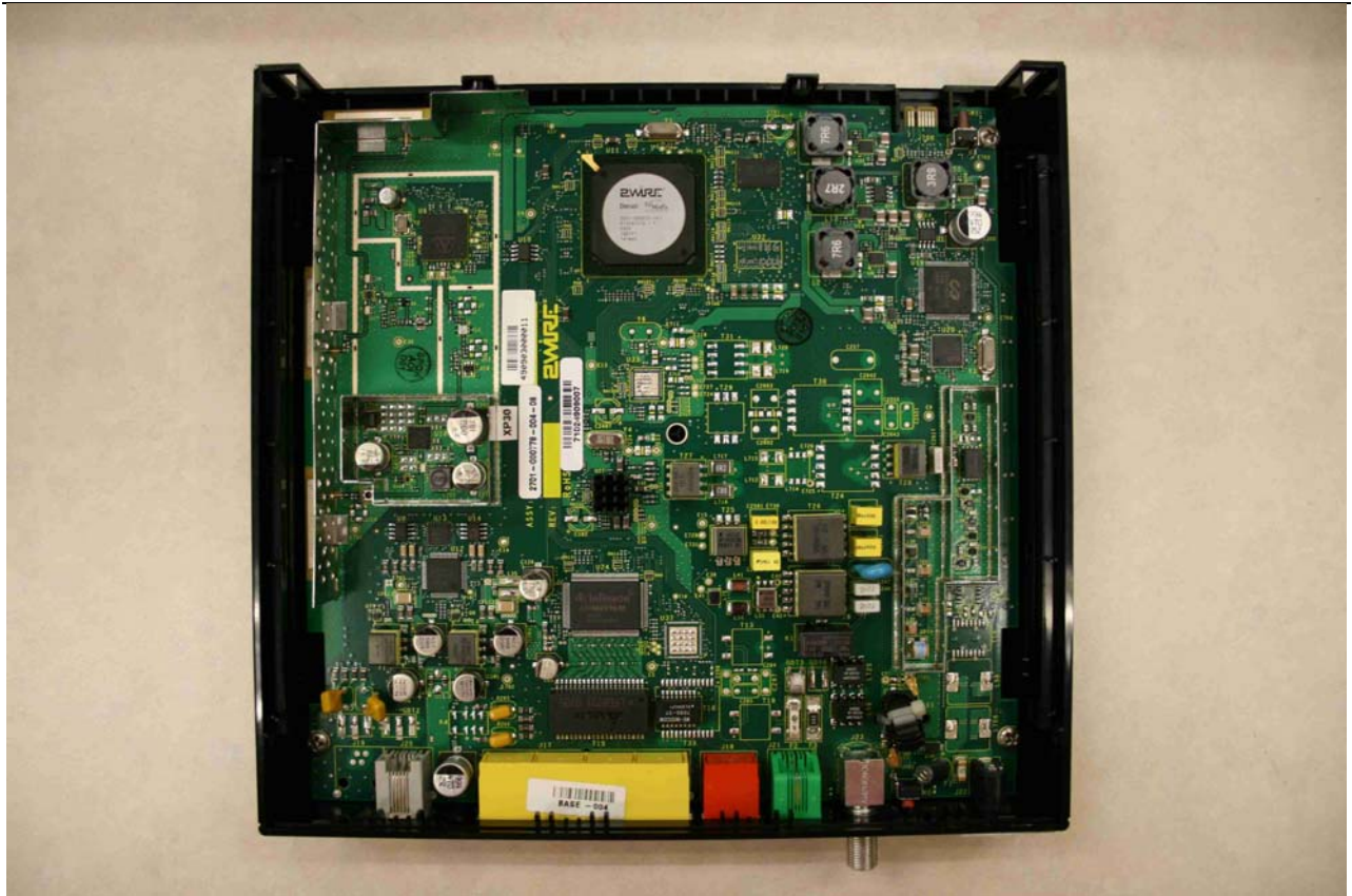
Figure 5: Internal Photo of HomePortal 3801HGV - PCB Shields removed