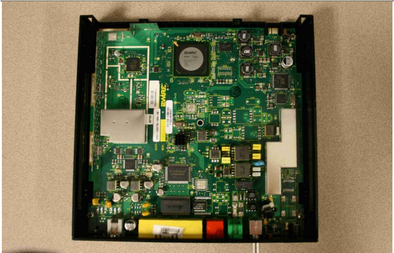
Figure 6: Internal Photo of HomePortal 3801HGV - PCB Shields not removed