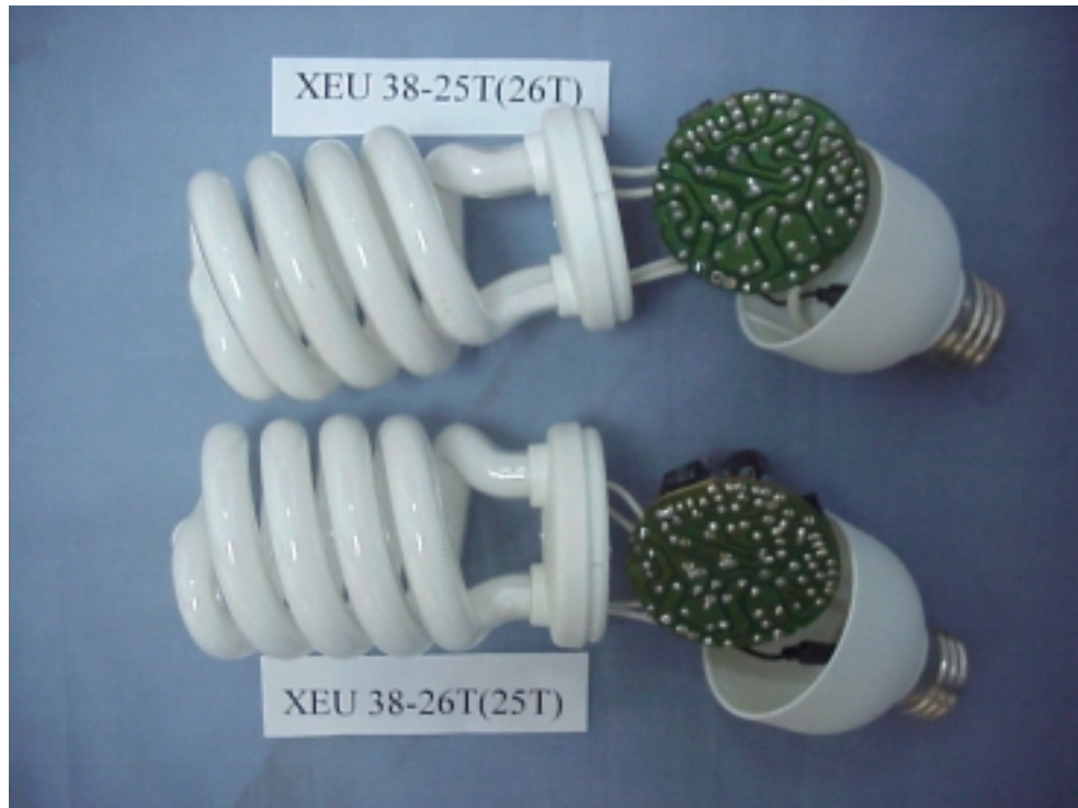
Figure 1 ENERGY SAVING LAMP (M/N: XEU38-T SERIAL) COVER REMOVED