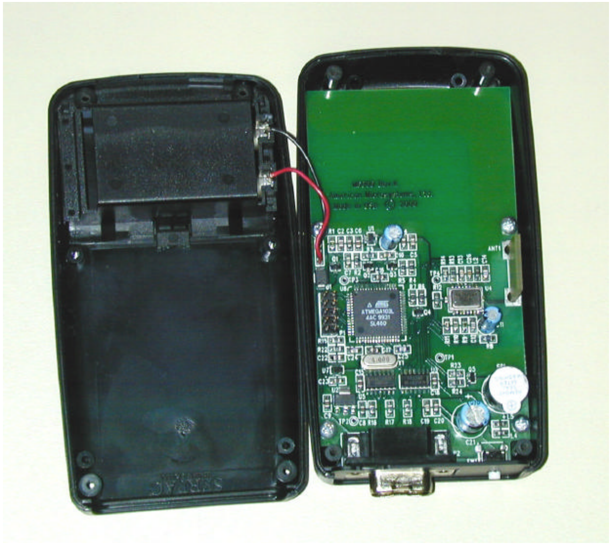
M6000 Internal photo: Component side of PCB