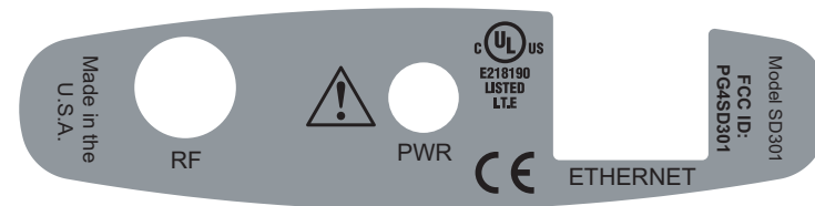
408025-002 LABEL, FCC, SD301, MADE IN USA