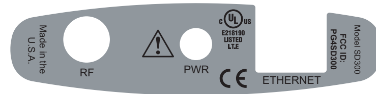
408025-001 LABEL, FCC, SD300, MADE IN USA