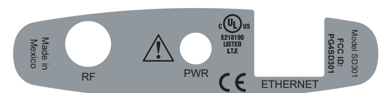
408025-004 LABEL, FCC, SD301, MADE IN MEXICO