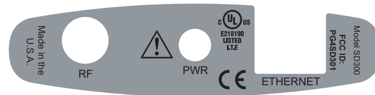
408026-001 LABEL, FCC, SD301, MADE IN USA