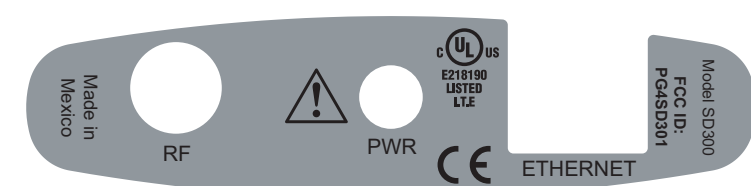
408028-001 LABEL, FCC, SD301, MADE IN MEXICO