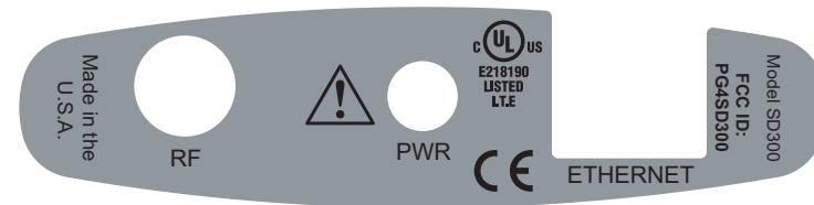
408025-001 LABEL, FCC, SD300, MADE IN USA