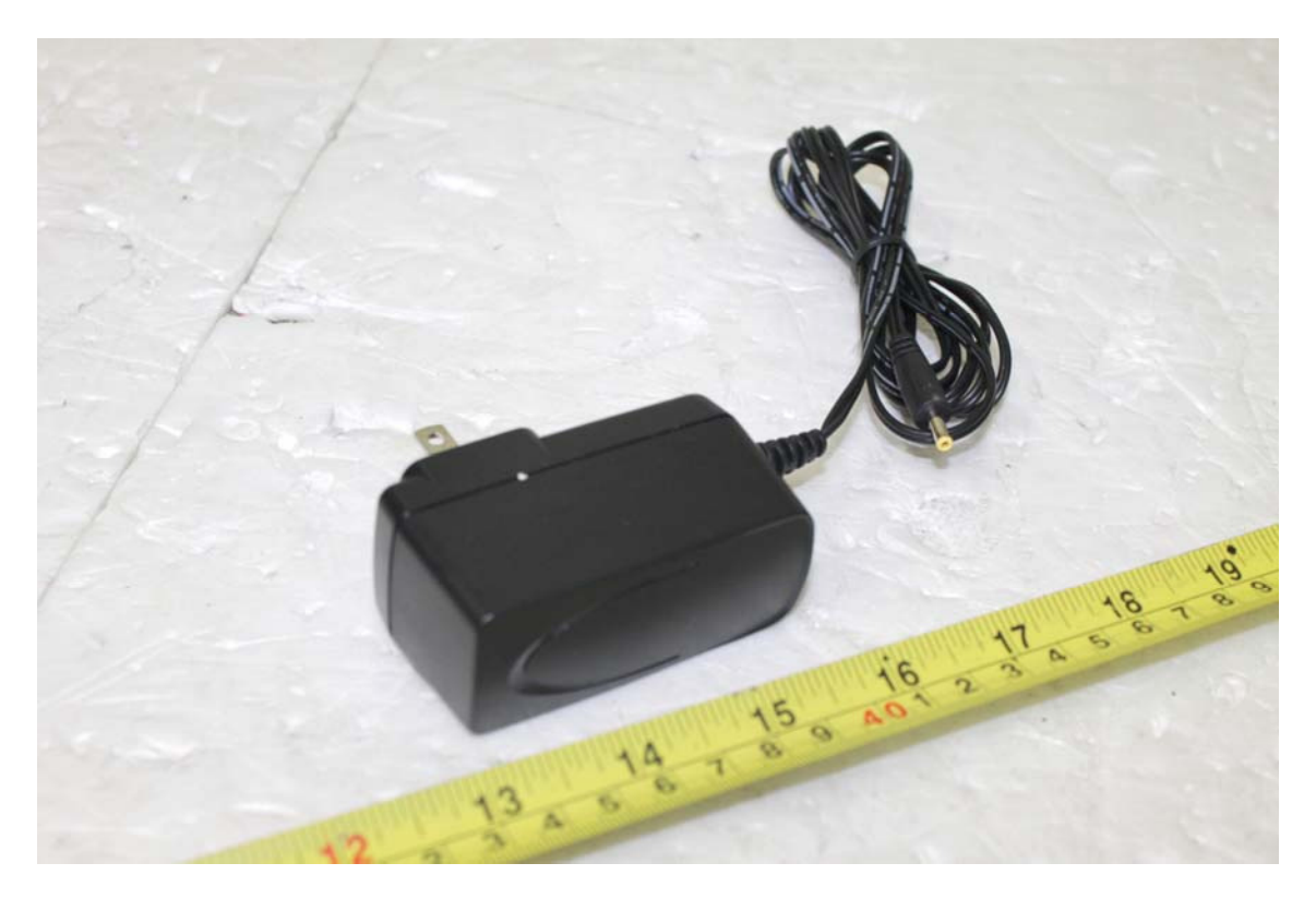
- View of rear