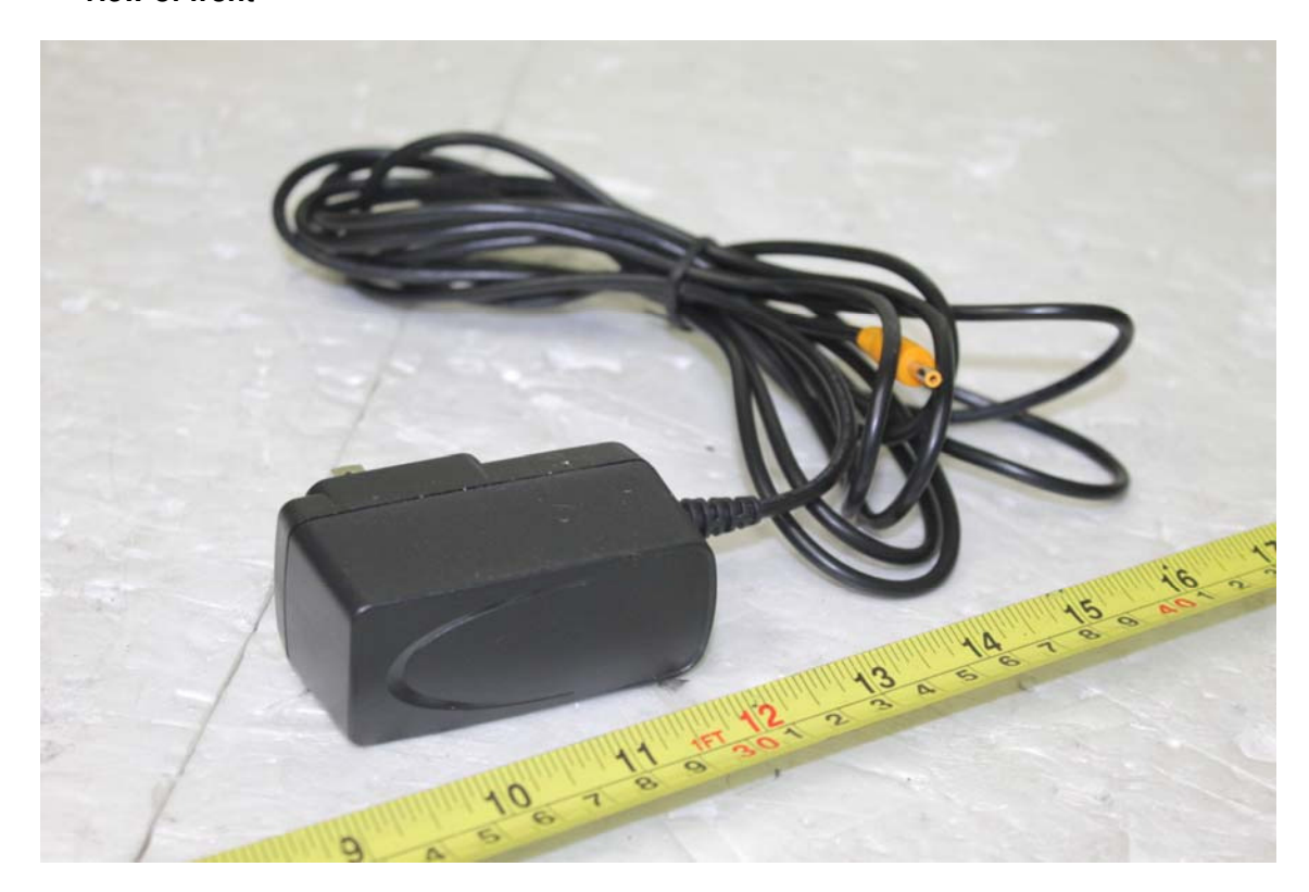
- View of rear