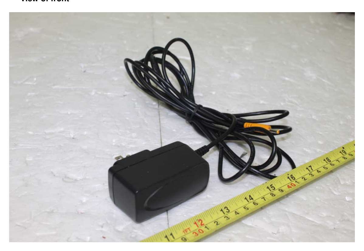
- View of rear