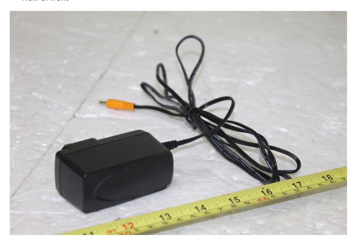
- View of rear