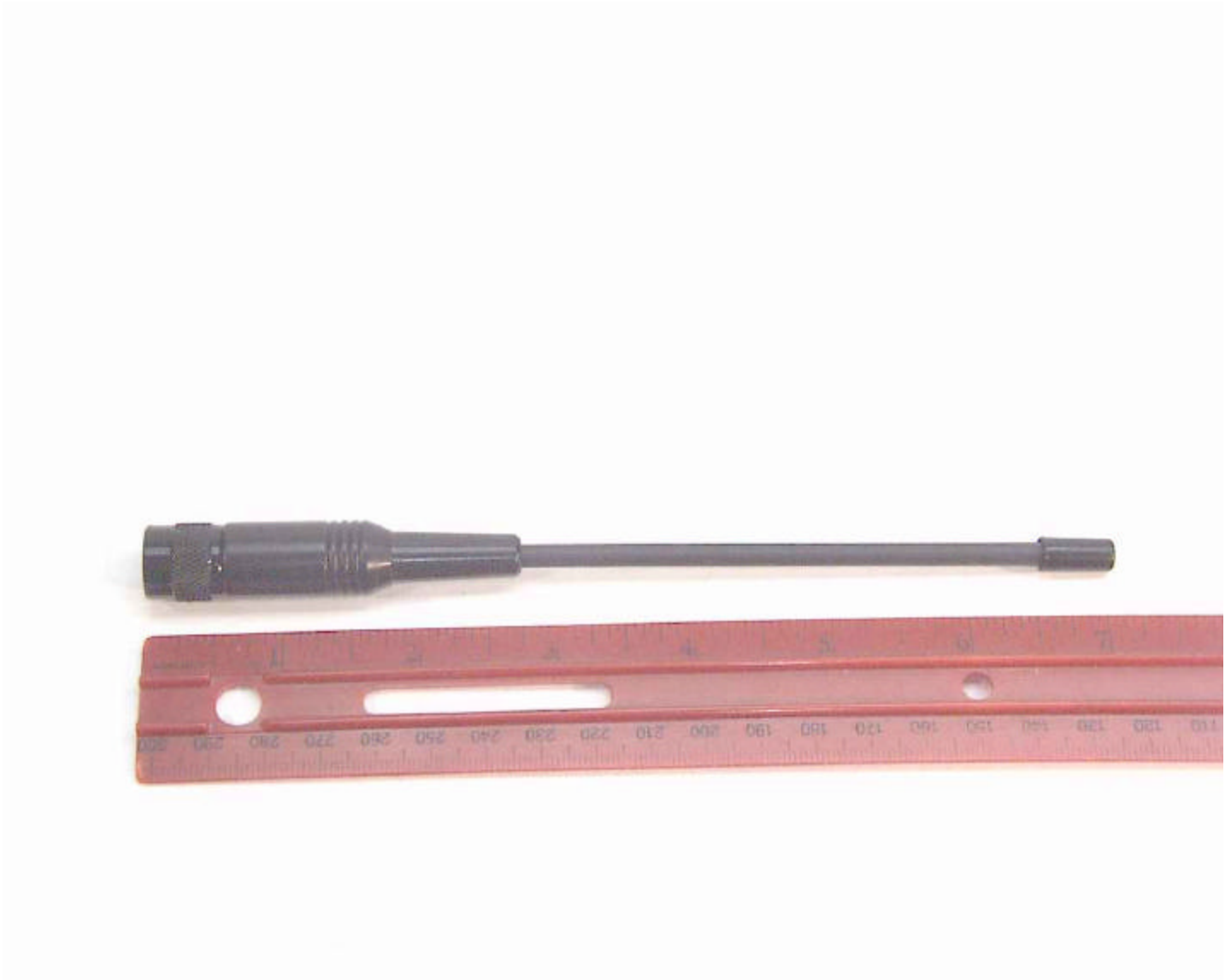
Max Lion Corporation, B-27 T Antenna, Gain = 3 dBi