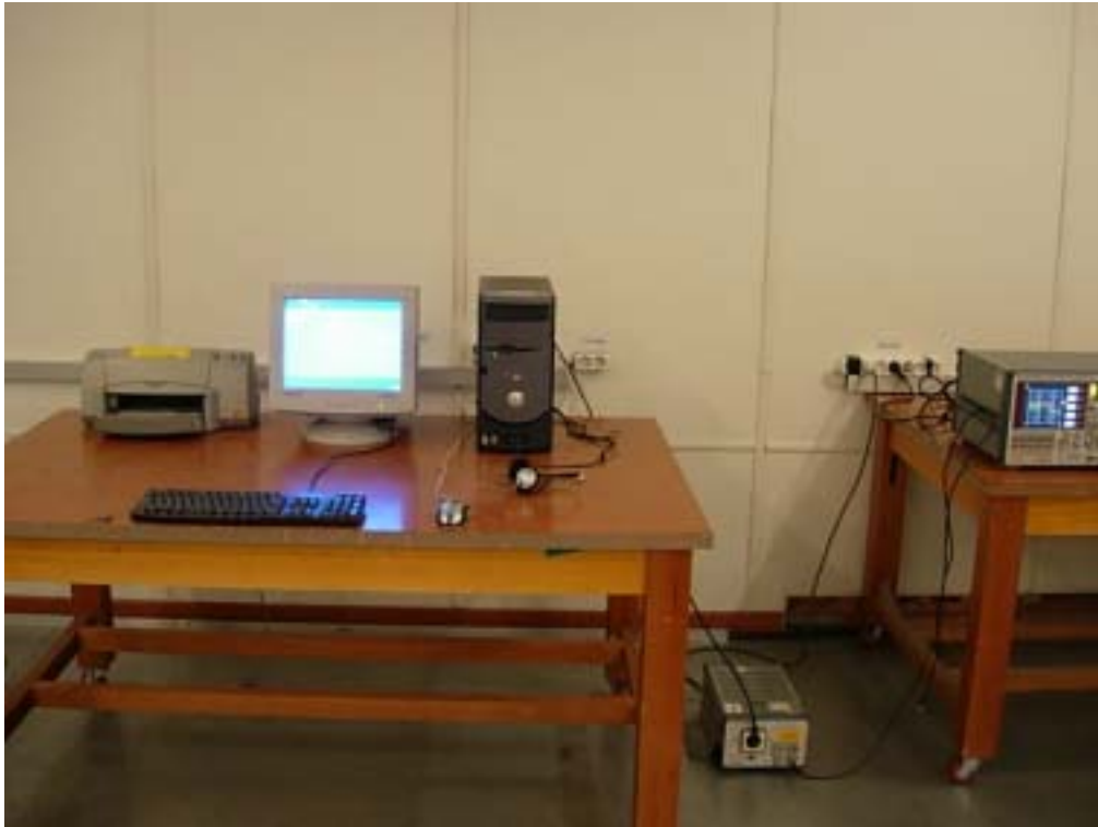
< FORNT PHOTOGRAPH OF CONTINUOUS DISTURBANCE VOLTAGE >