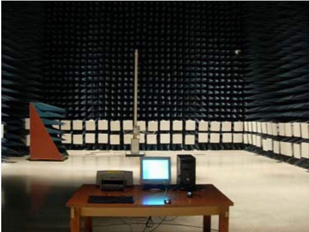
< FRONT PHOTOGRAPH OF RADIATED DISTURBANCE >