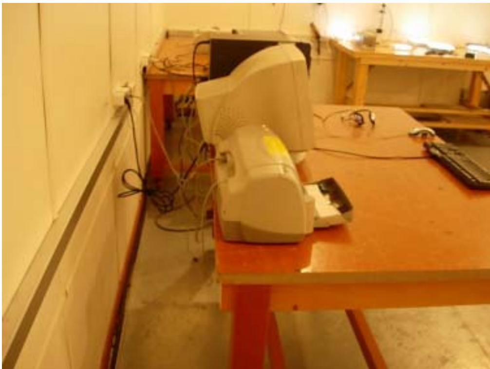
< REAR PHOTOGRAPH OF CONTINUOUS DISTURBANCE VOLTAGE >