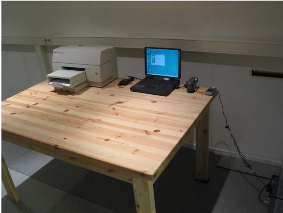
Picture 1 EUT test setup