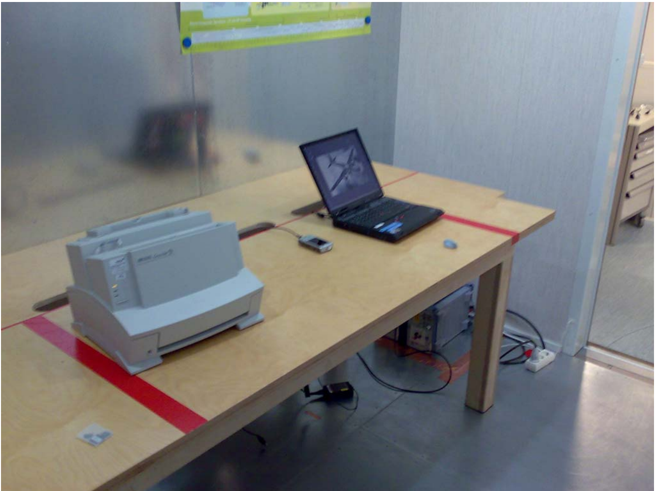
Picture 4 AC powerline conducted emission measurement GSM RX/BT TX/WLAN TX + Computer peripherals