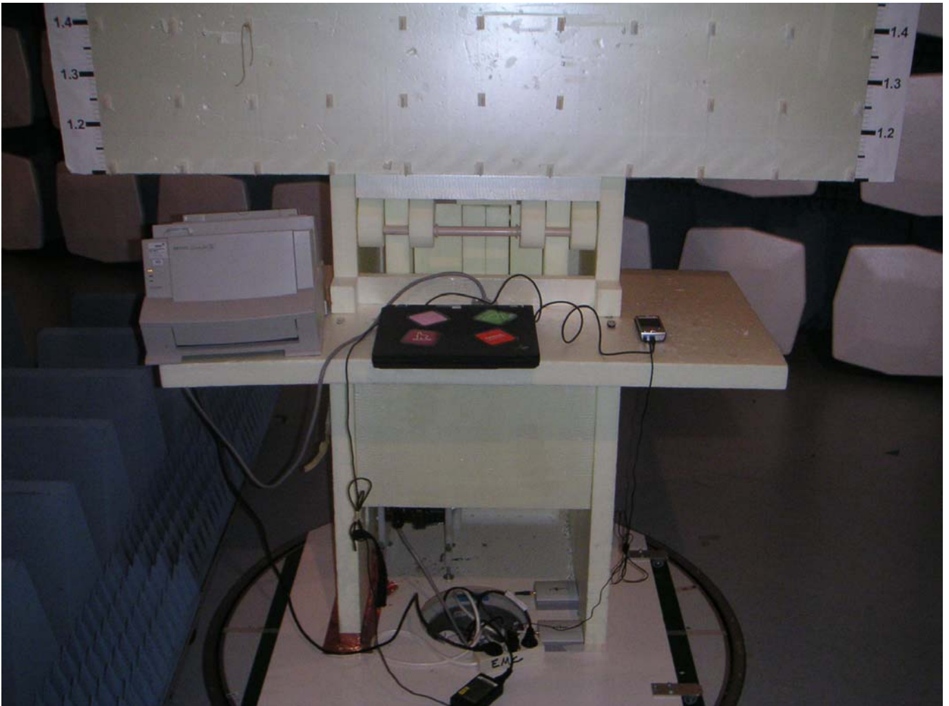
Picture 2 Radiated emission measurement GSM RX/BT TX/WLAN TX + Computer peripherals