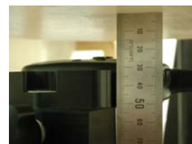
Figure 11. Mouth