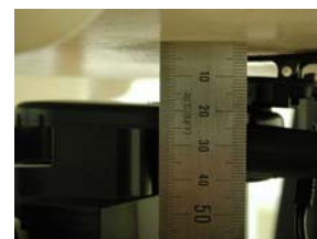
Figure 12. Body SAR