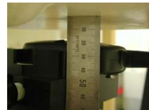
Figure 11. Mouth Face SAR Test Setup