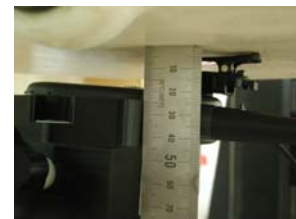
Figure 12. Body SAR Test Setup