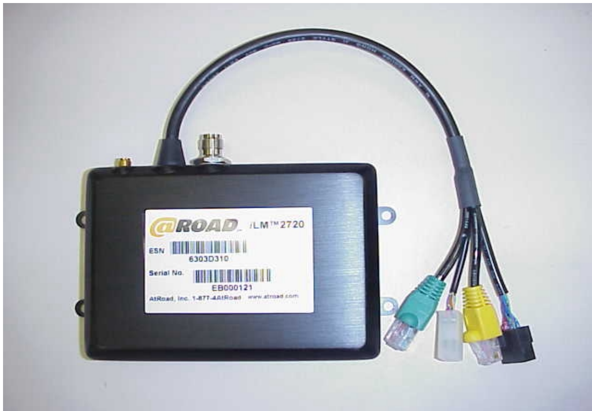
ILM2720 ASSEMBLY WITH TOP CLOSE