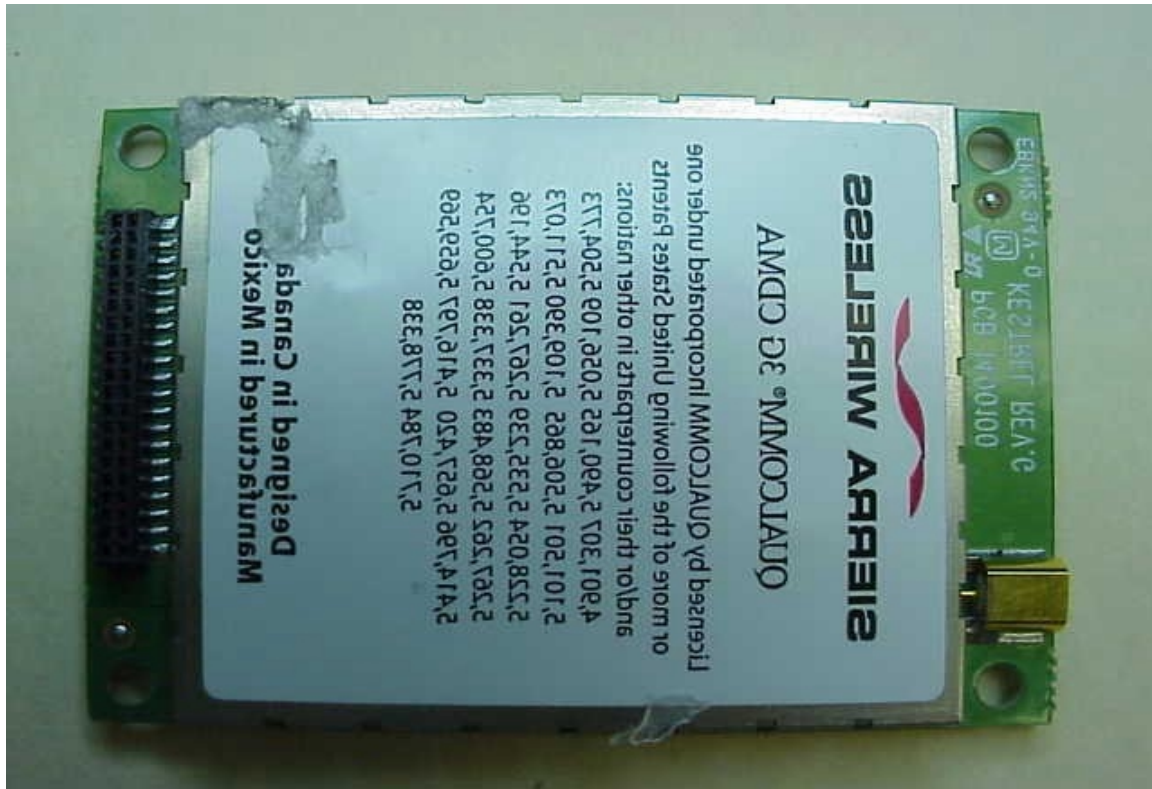
TRANSMITTER, MODEM, BOTTOM SIDE