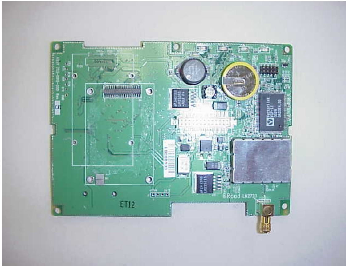
EUT, iLM2720, PCB TOP SIDE