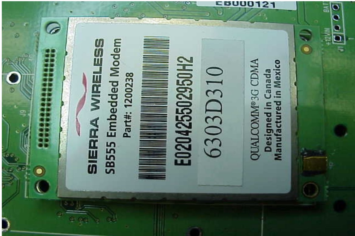
TRANSMITTER, MODEM, TOP SIDE