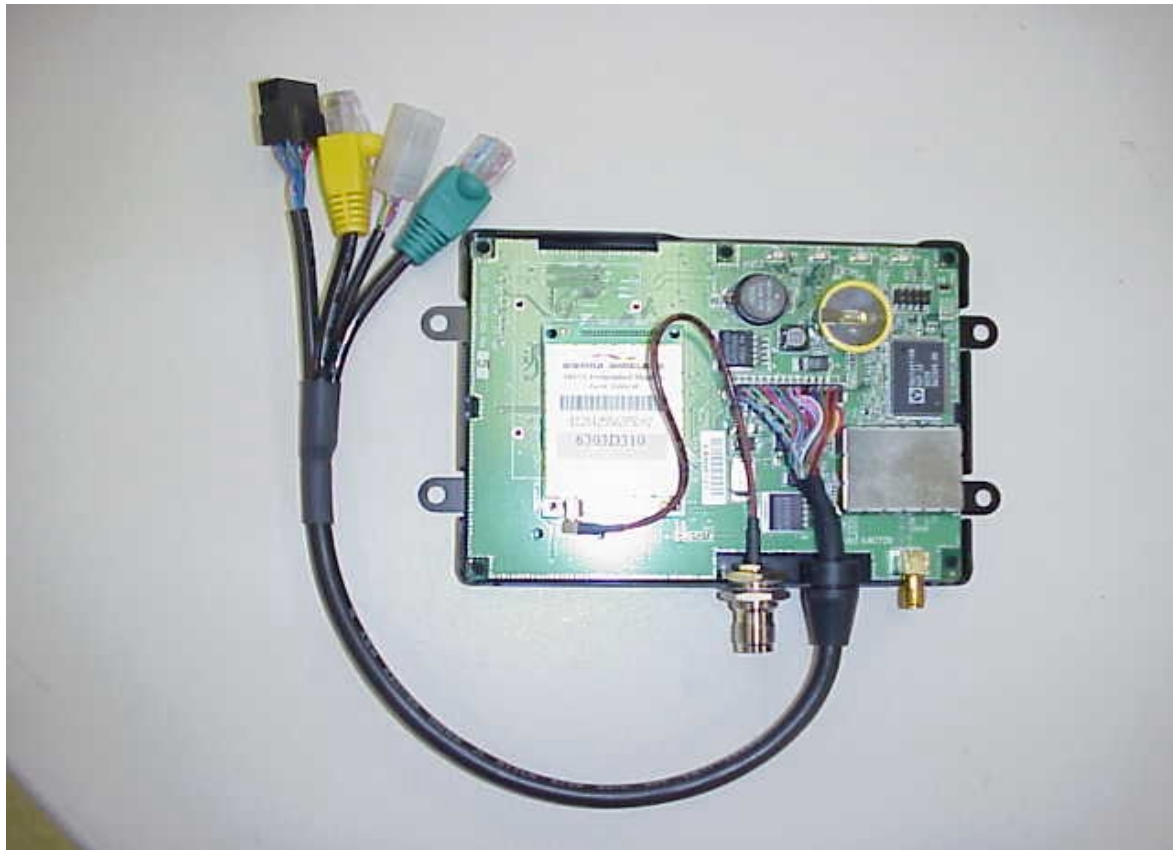
ILM2720 ASSEMBLY WITH TOP OPEN