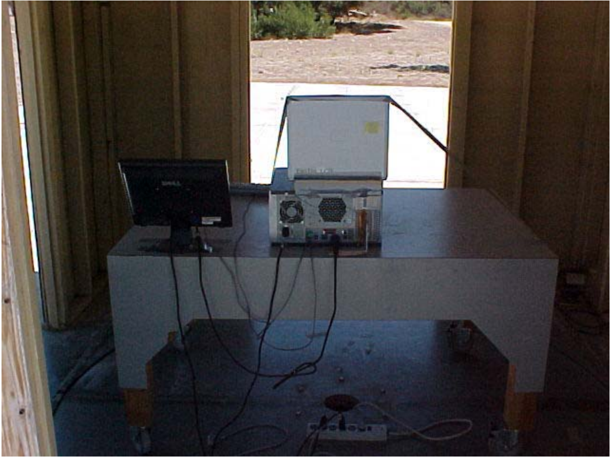
Radiated Emissions Measurement (Rear View) Emilia Antenna Setup