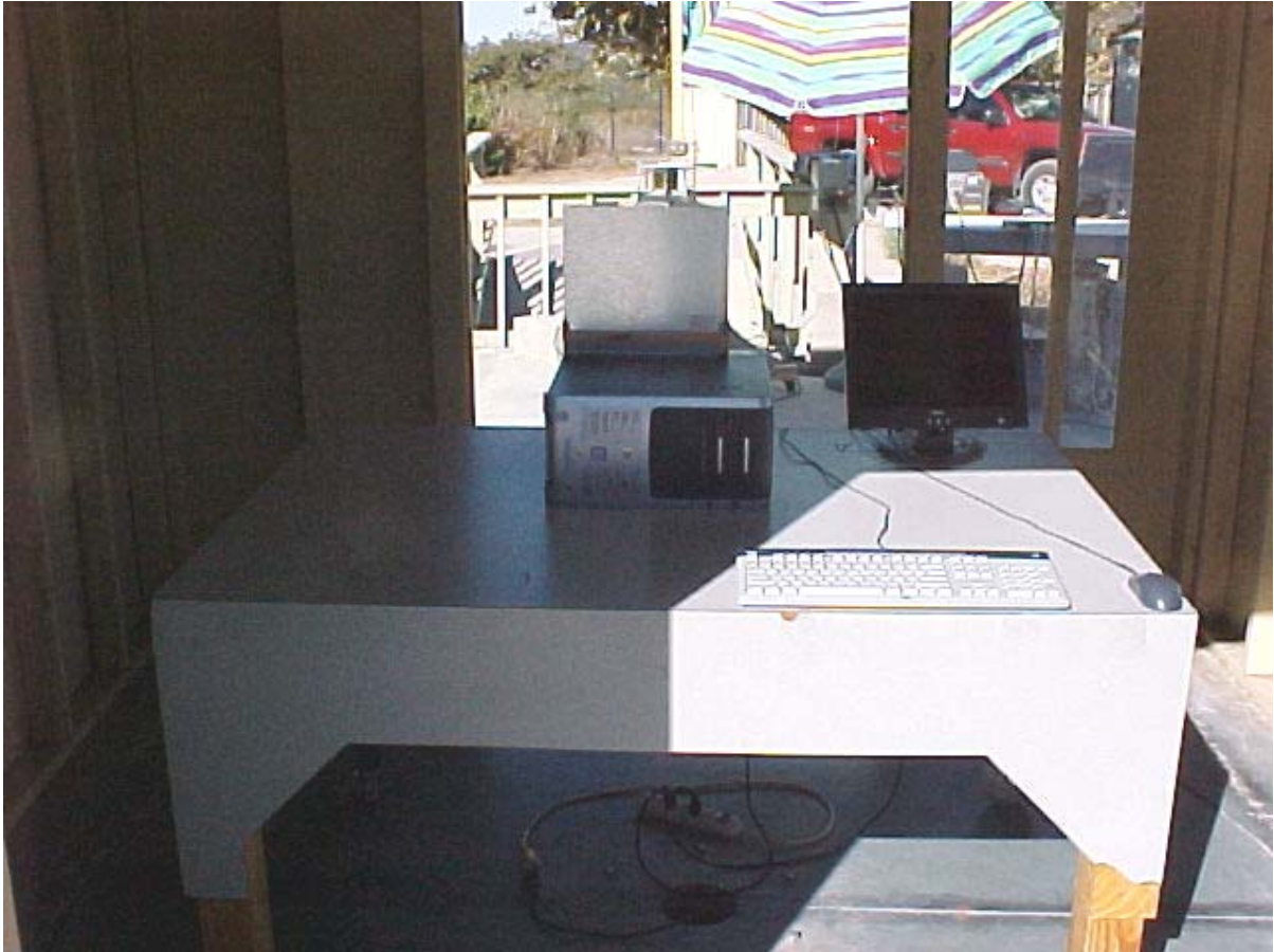
Radiated Emissions Measurement (Front View) Foxconn (Jakarta) Antenna Setup