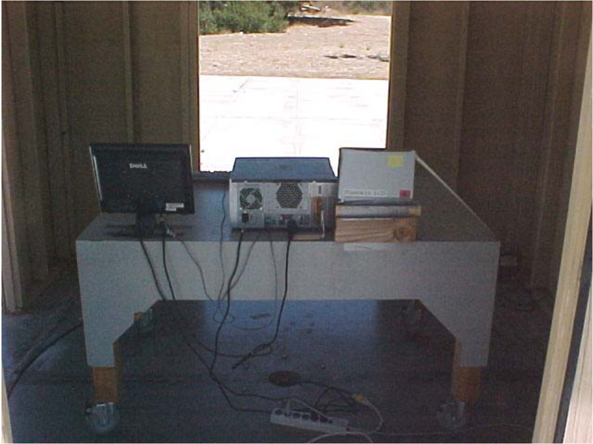
Radiated Emissions Measurement (Rear View) Pumpkin Antenna Setup