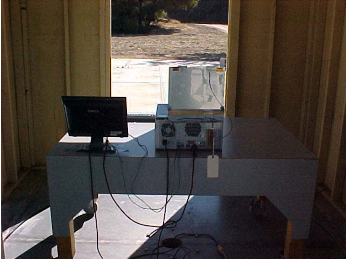
Radiated Emissions Measurement (Rear View) Foxconn (Jakarta) Antenna Setup