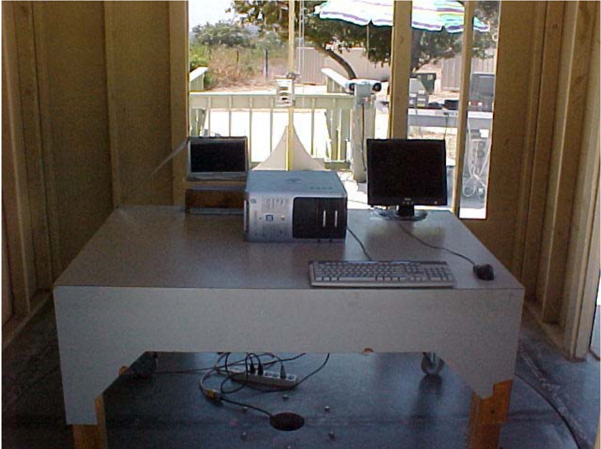
Radiated Emissions Measurement (Front View) Pumpkin Antenna Setup