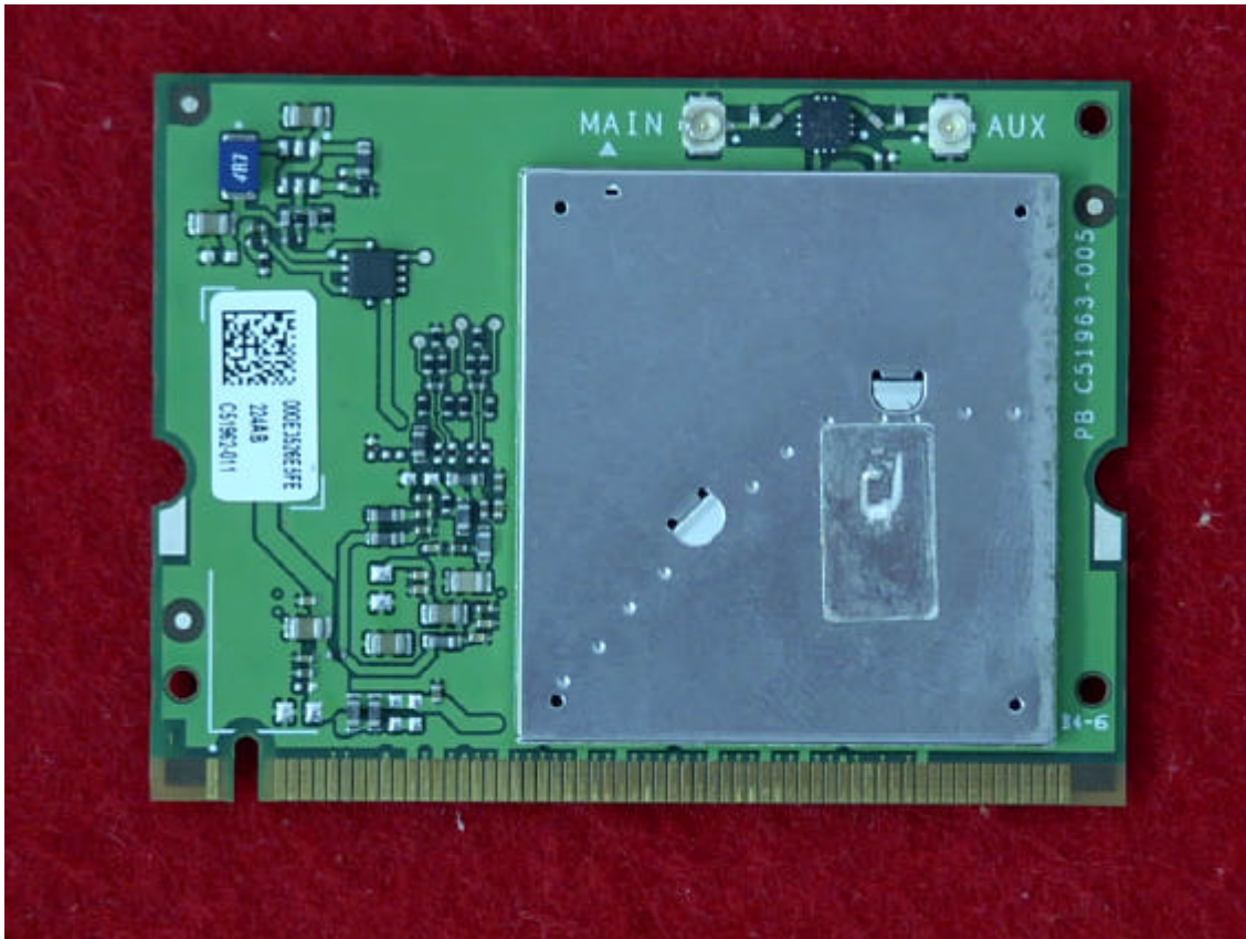
Top View “Insulation removed”