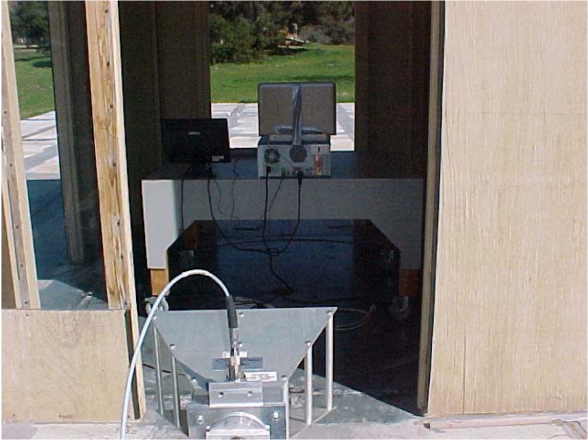
Radiated Emissions Measurement (1-26.5 GHz) (Rear View) Setup