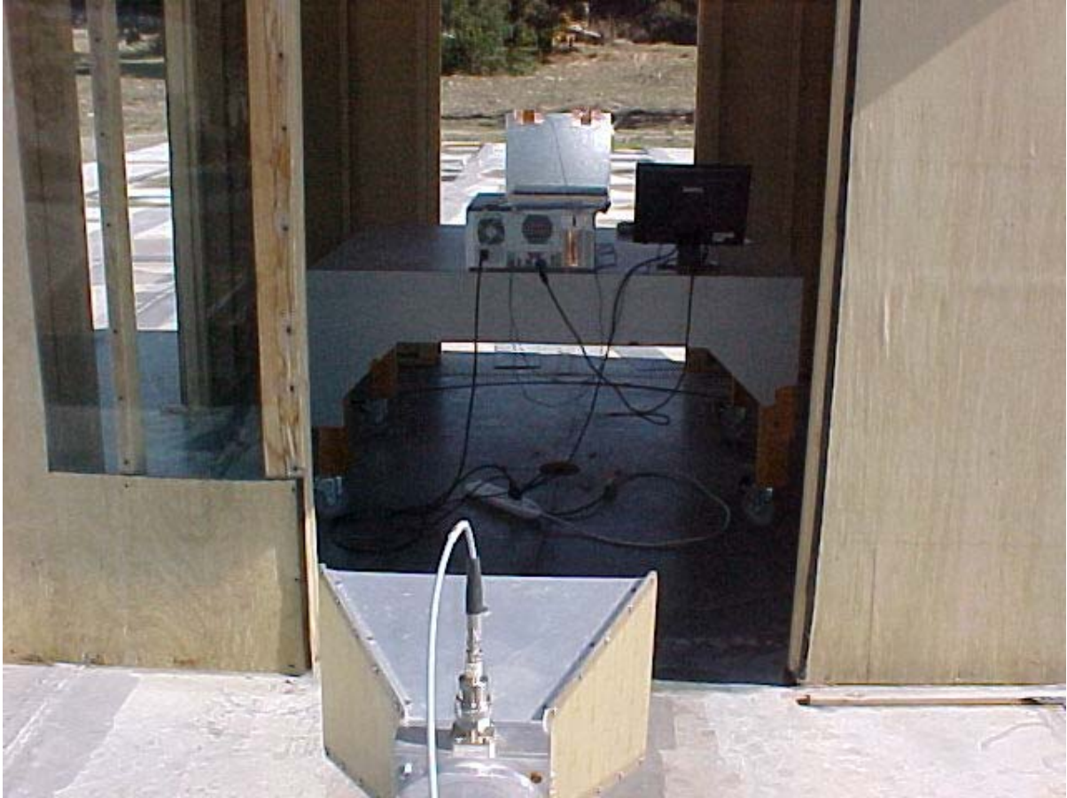
Radiated Emissions Measurement (1-26.5 GHz) (Rear View) Setup