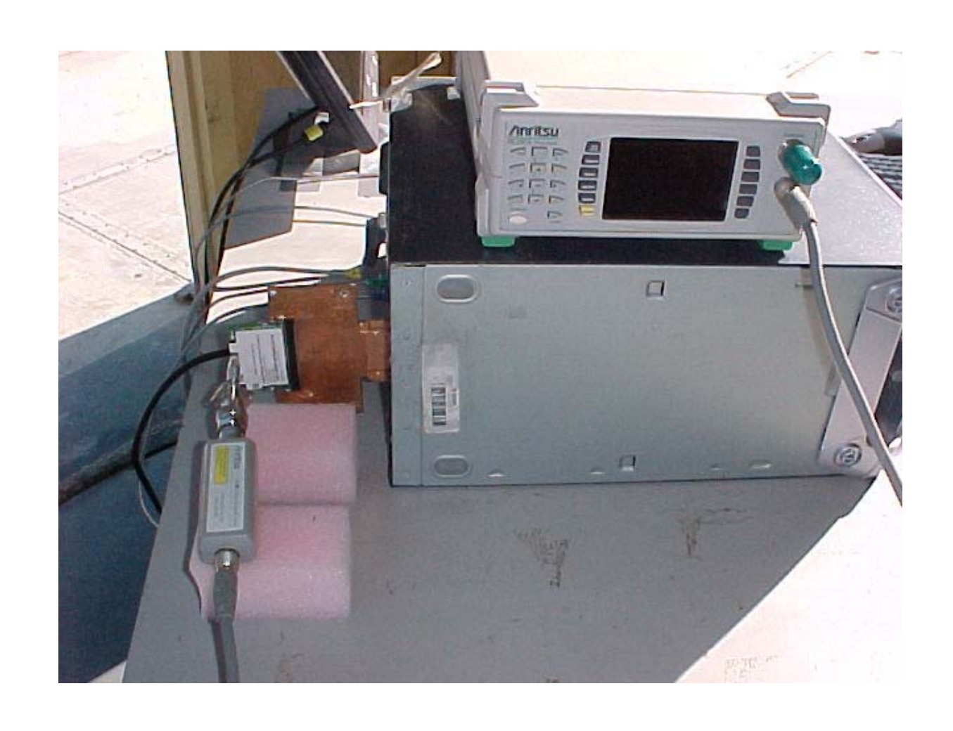
Maximum Peak Output Power Measurement Setup