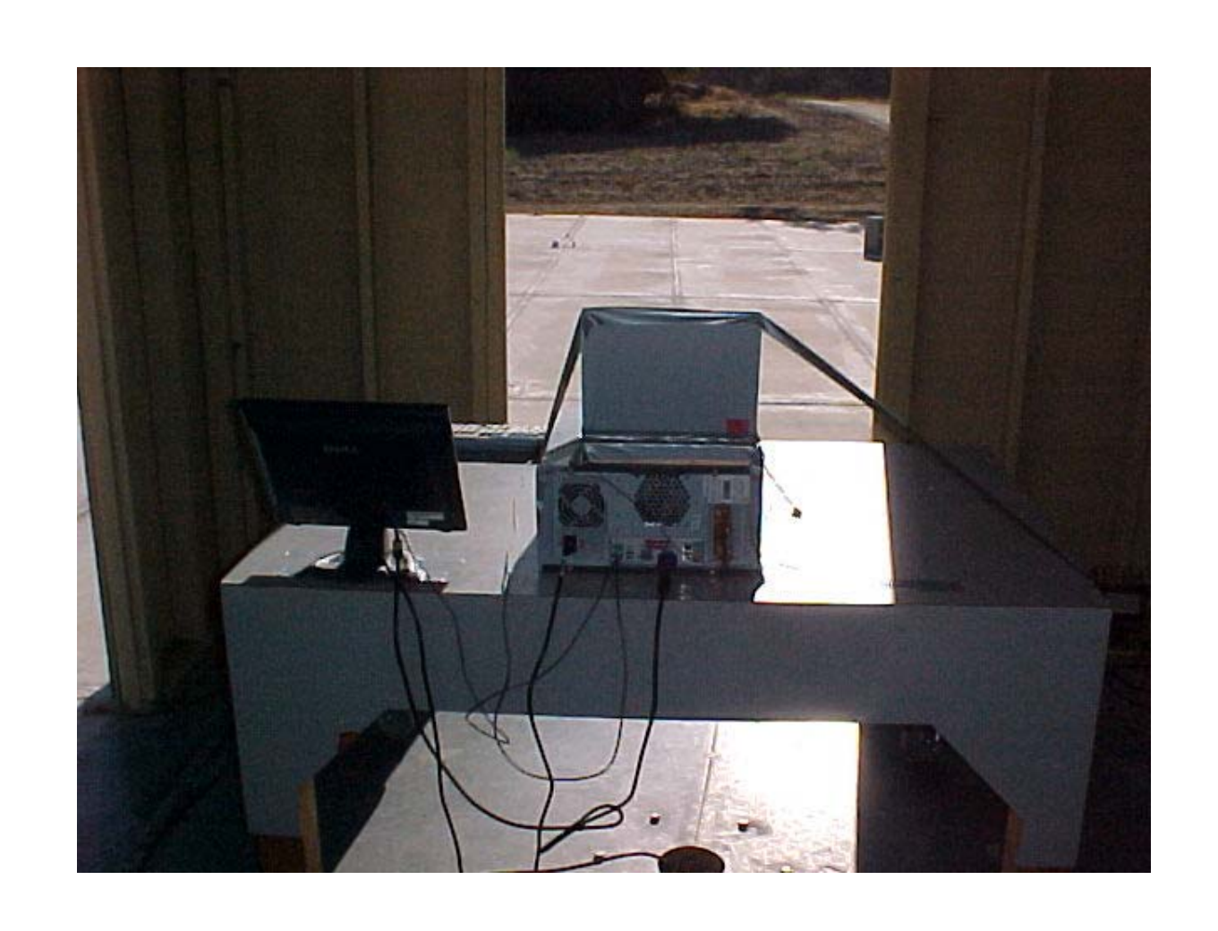
Radiated Emissions Measurement (1-26.5 GHz) (Rear View) Setup