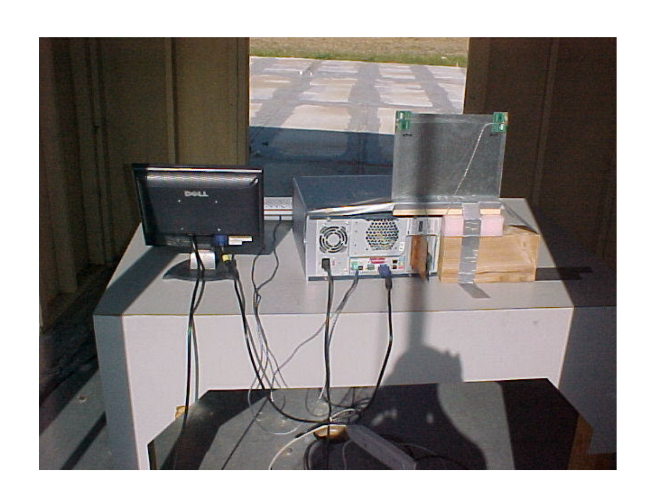
Radiated Emissions Measurement (1-26.5 GHz) (Rear View) Setup