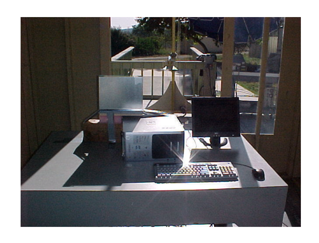
Radiated Emissions Measurement (1-26.5 GHz) (Front View) Setup