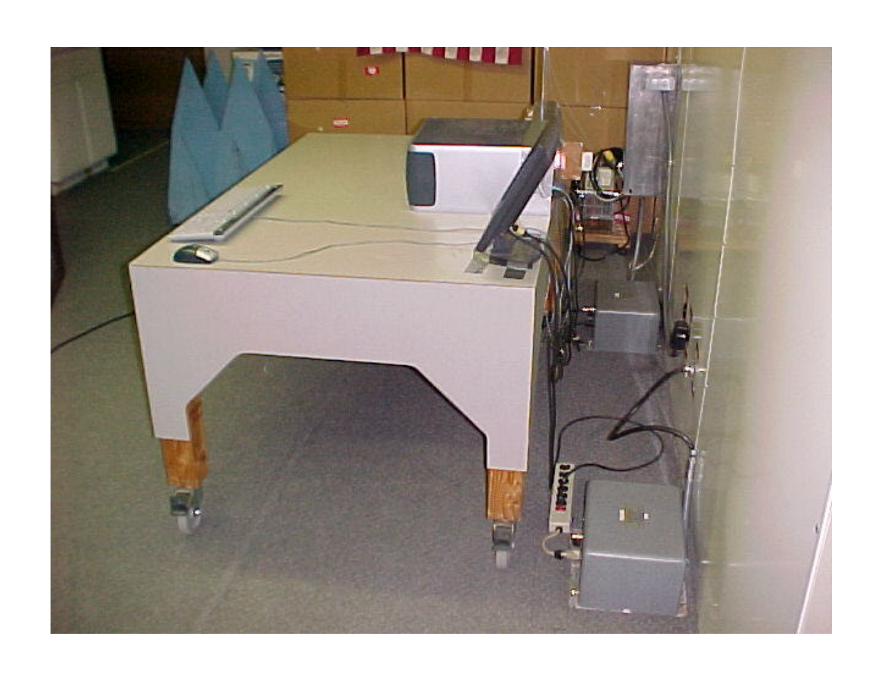
AC Conducted Emissions Measurement (Rear View) Setup