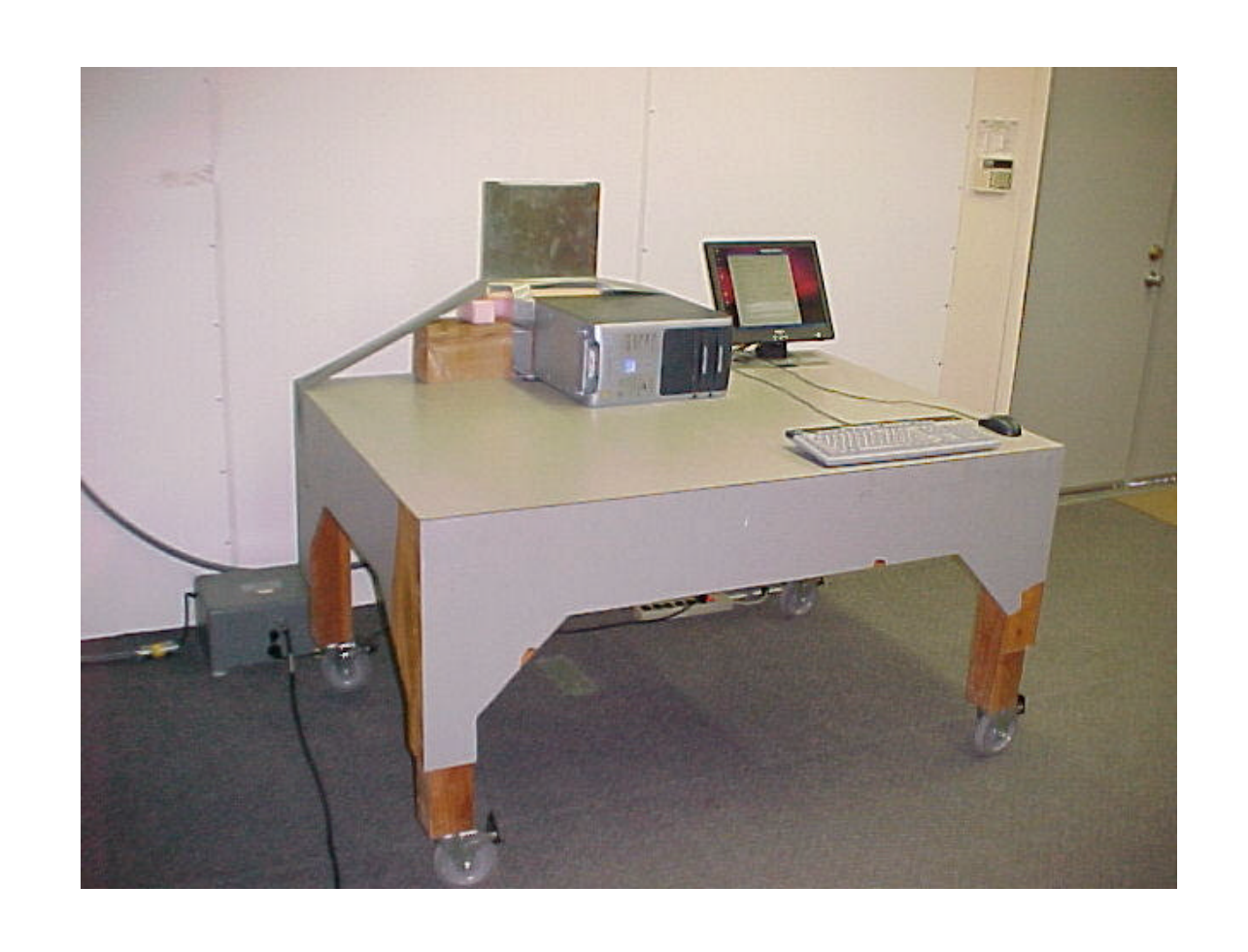
AC Conducted Emissions Measurement (Front View) Setup