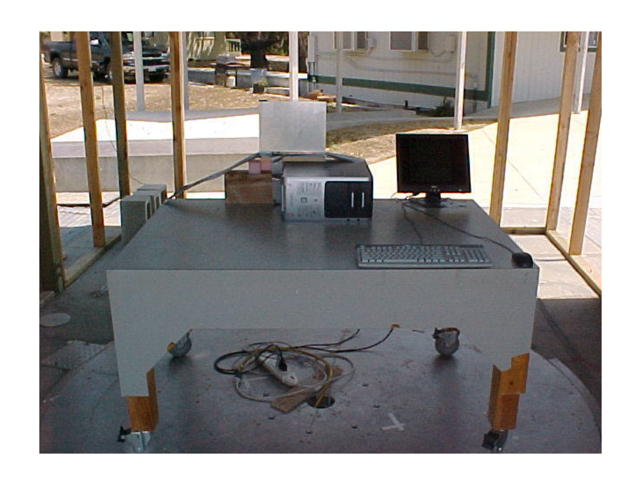
Radiated Emissions Measurement (30-1000 MHz) (Front View) Setup