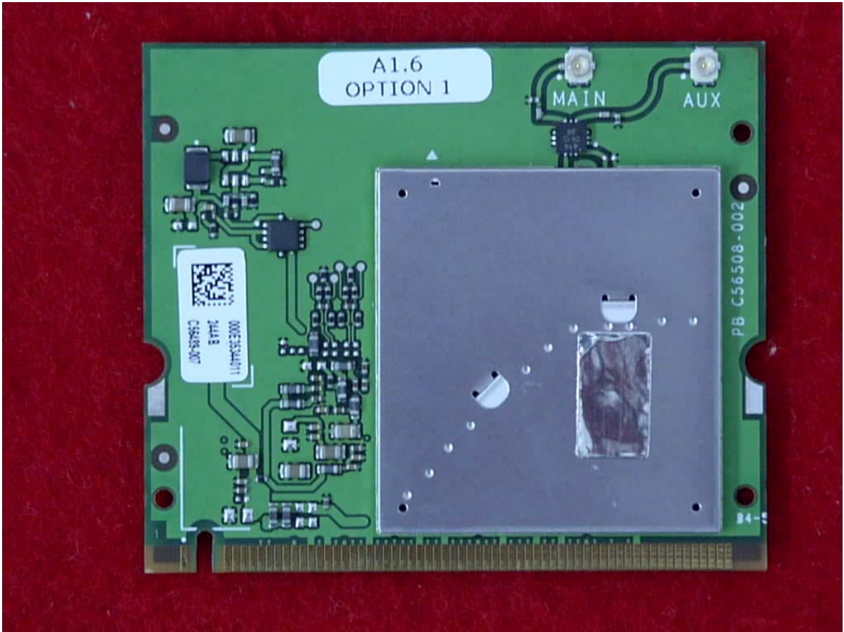
Top View “Insulation removed”