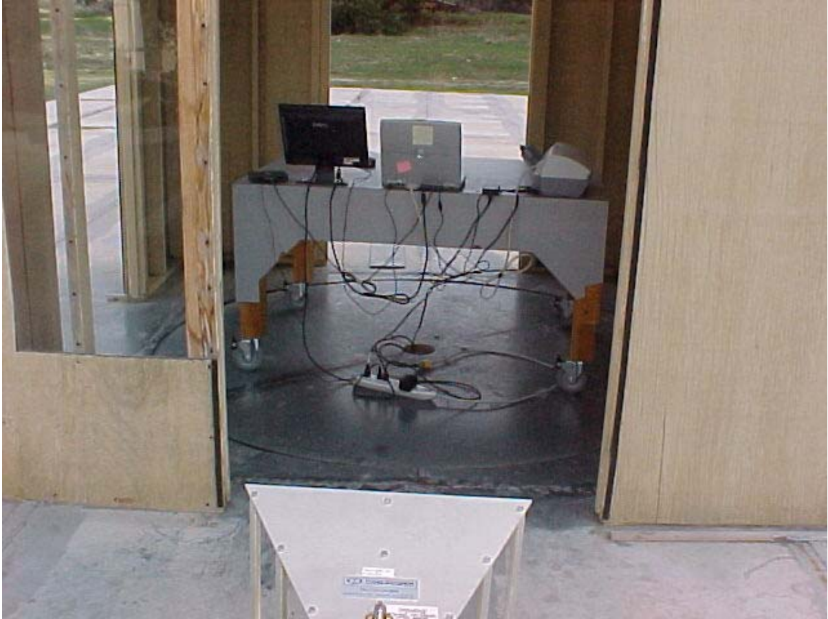
Radiated Emissions Measurement (1-26.5 GHz) (Rear View) Setup