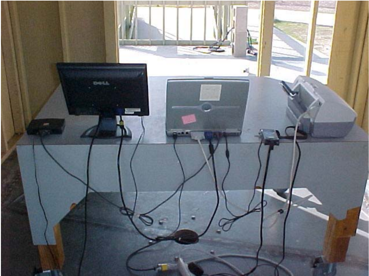
Radiated Emissions Measurement (30-1000 MHz) (Rear View) Setup