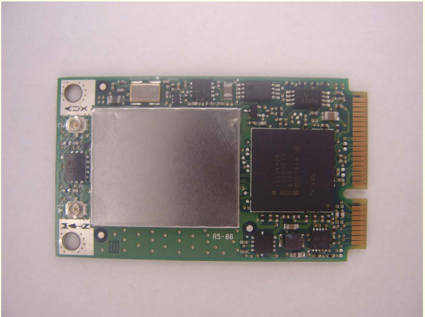
Top View “Insulation removed”