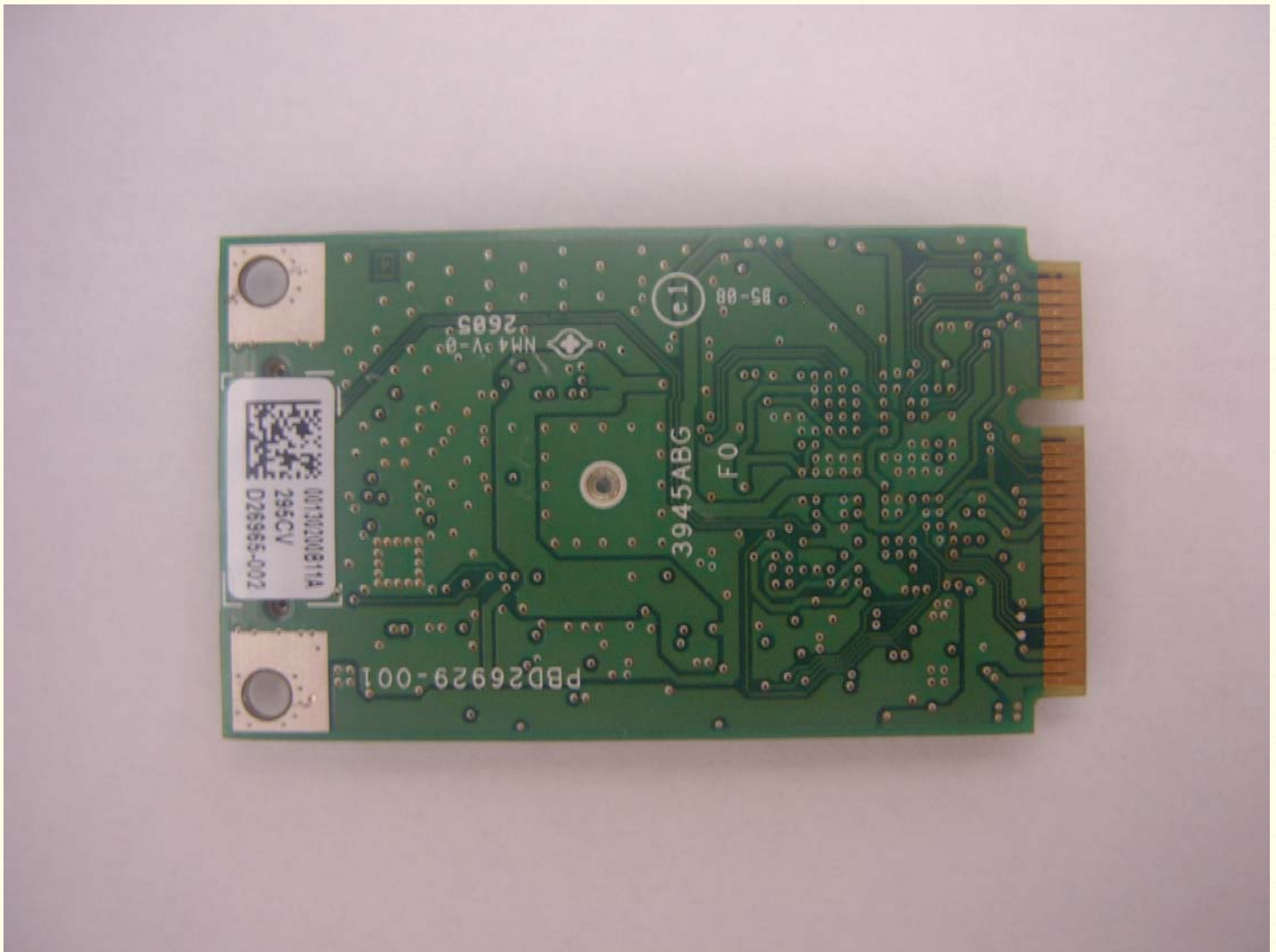
Bottom View “Insulation removed”