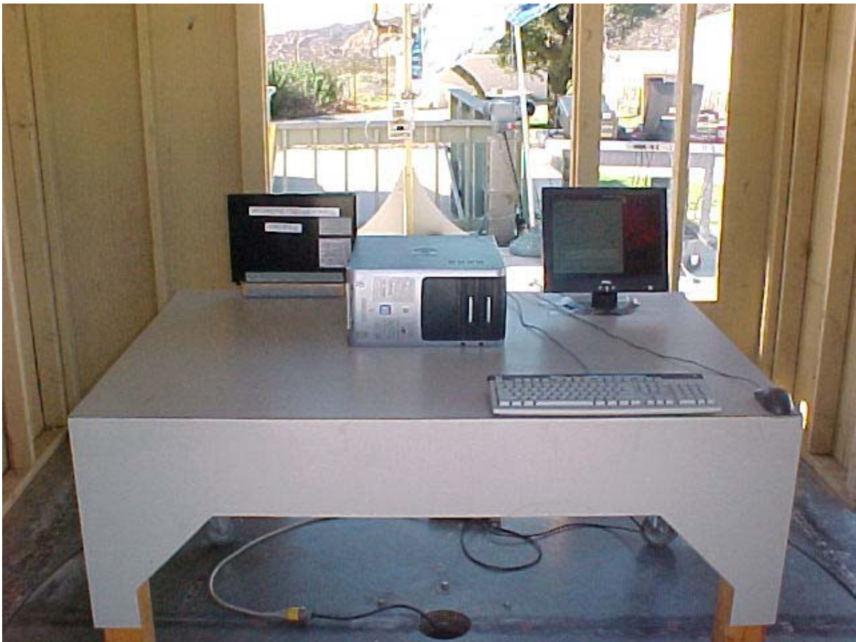
Radiated Emissions Measurement (Front View) Whayu (Fujitsu Topaz) Antenna Setup