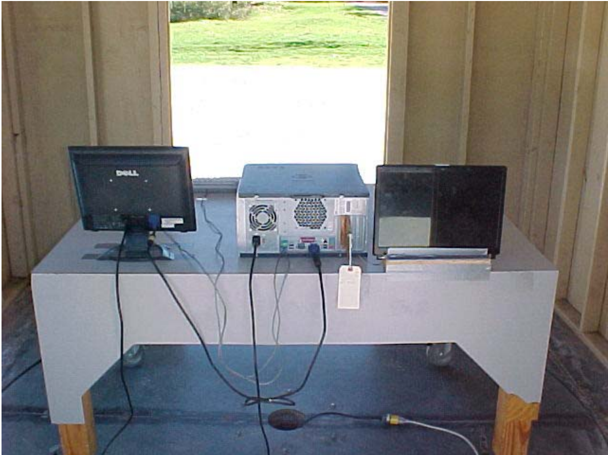
Radiated Emissions Measurement (Rear View) Wayu (Fujitsu Topaz) Antenna Setup