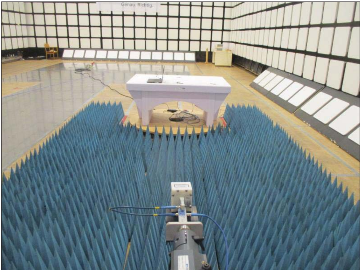
45 Picture 4: Radiated disturbance (> 1 GHz)