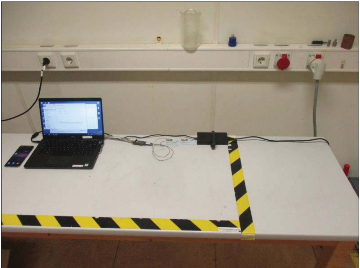
42 Picture 1: Conducted voltage emissions