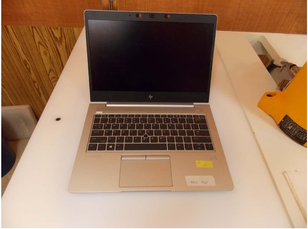
Front of Device