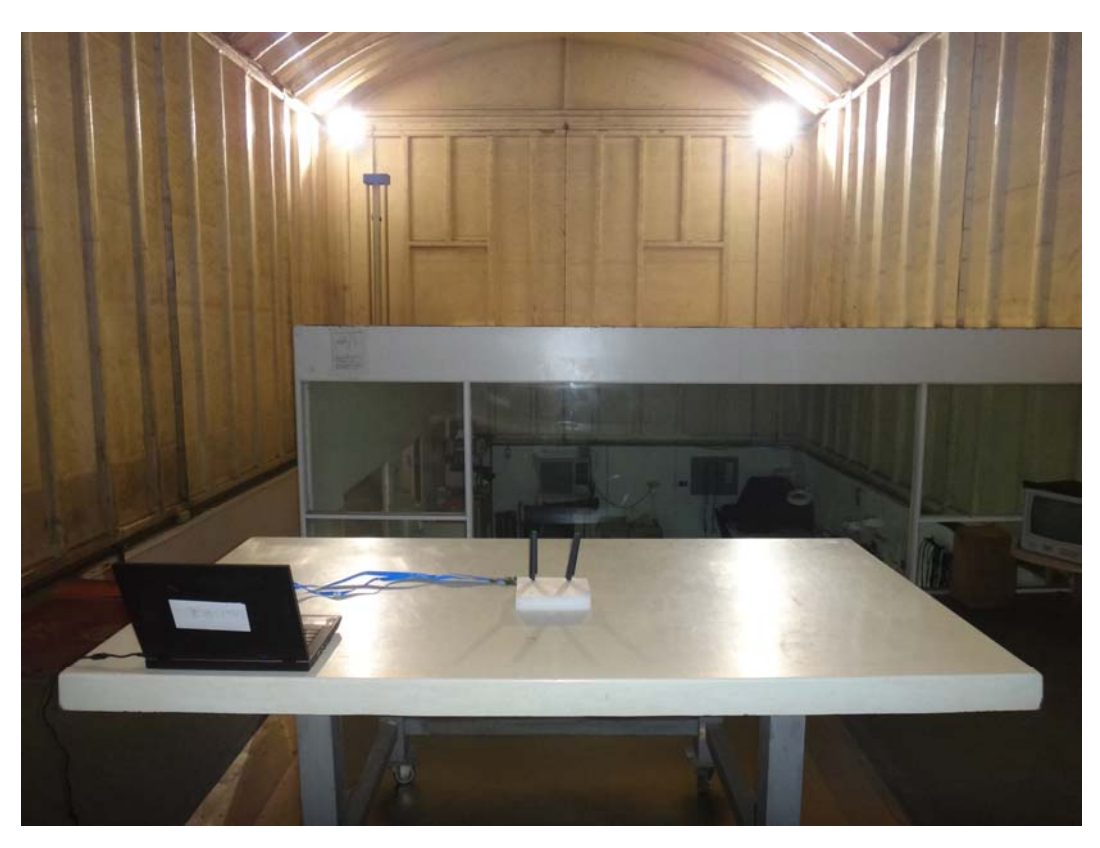
Back View of Radiated Test (Horn)