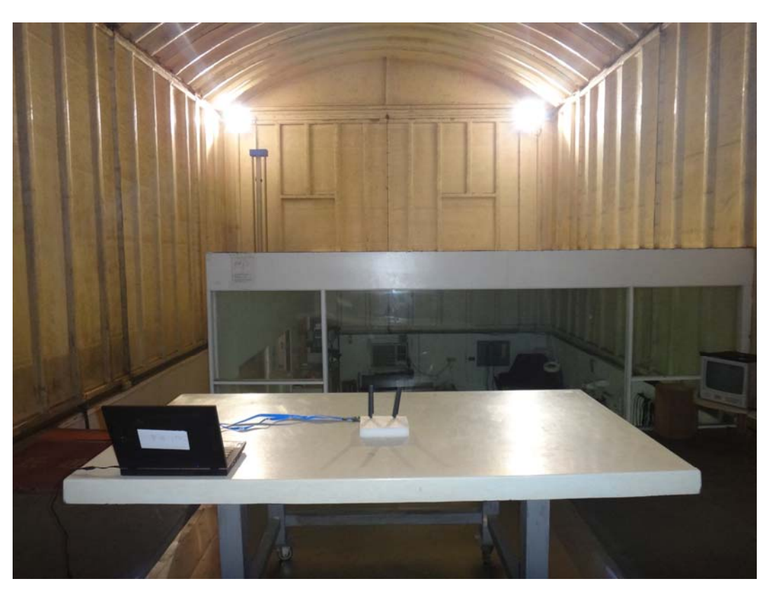
Back View of Radiated Test (Horn)