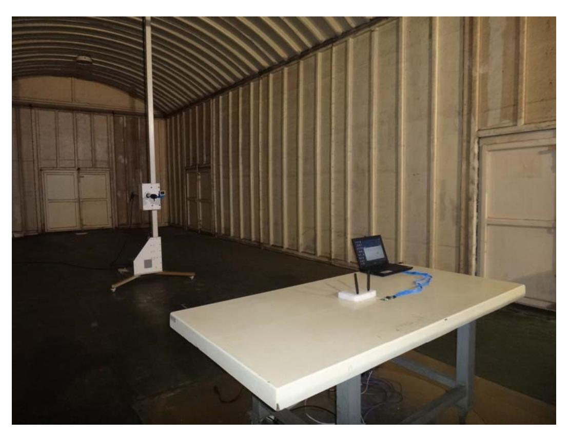
Front View of Radiated Test (Horn)