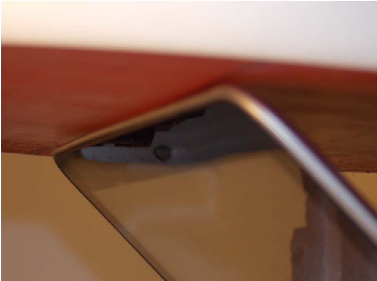
Test Position Curved Edge Both Antennas 0 mm Gap