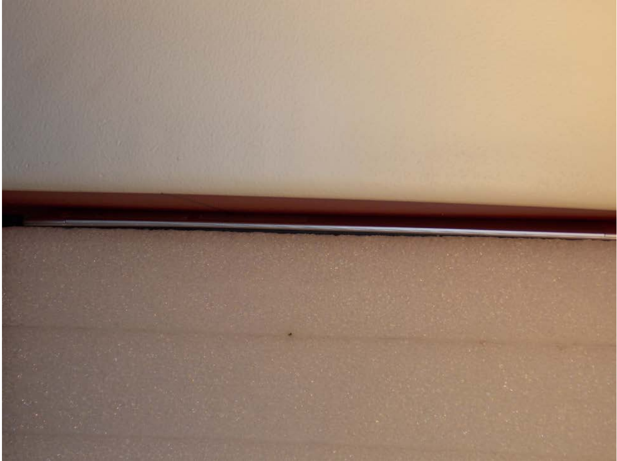
Test Position Back Both Antennas 0 mm Gap