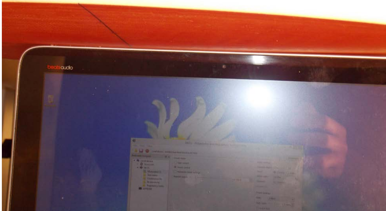
Test Position Edge Both Antennas 0 mm Gap