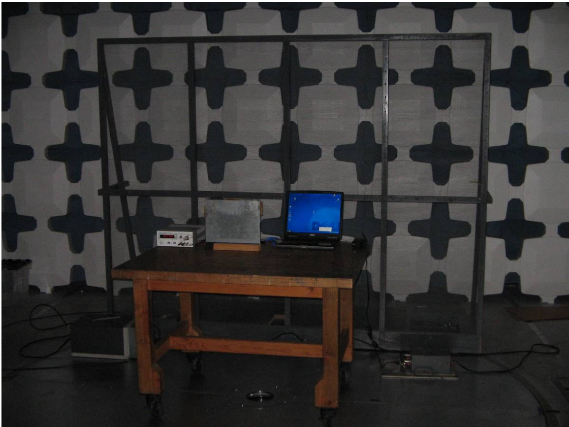
AC Conducted Emissions