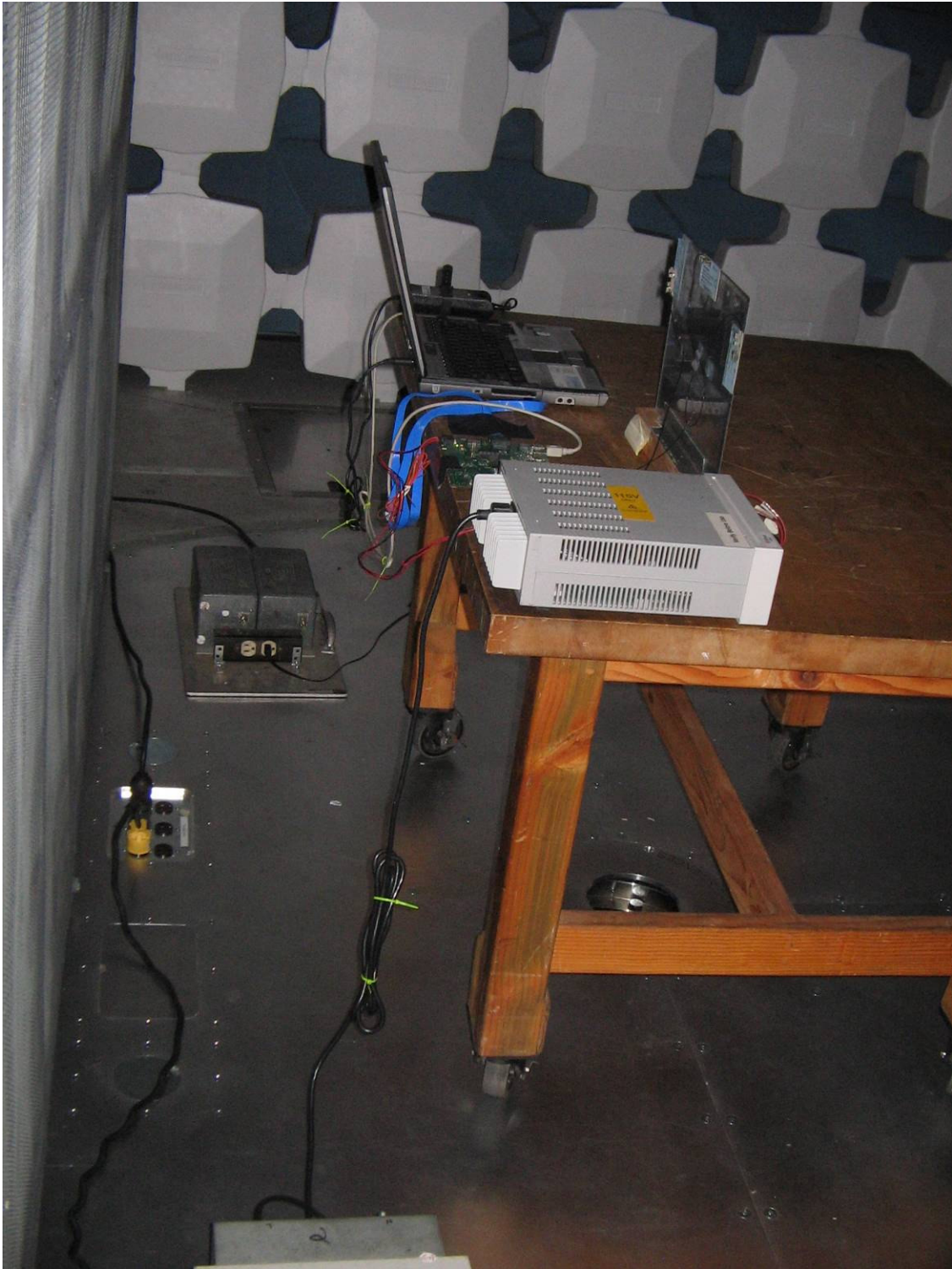
AC Conducted Emissions